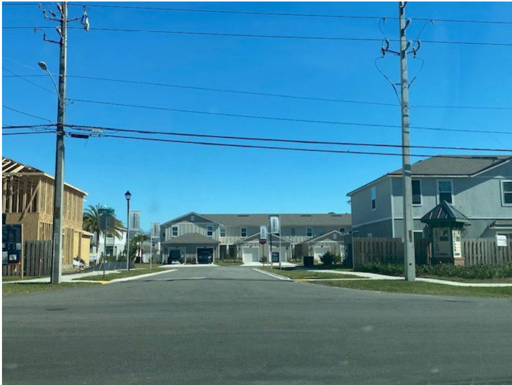
View of subject property developed with townhomes two properties to the east.