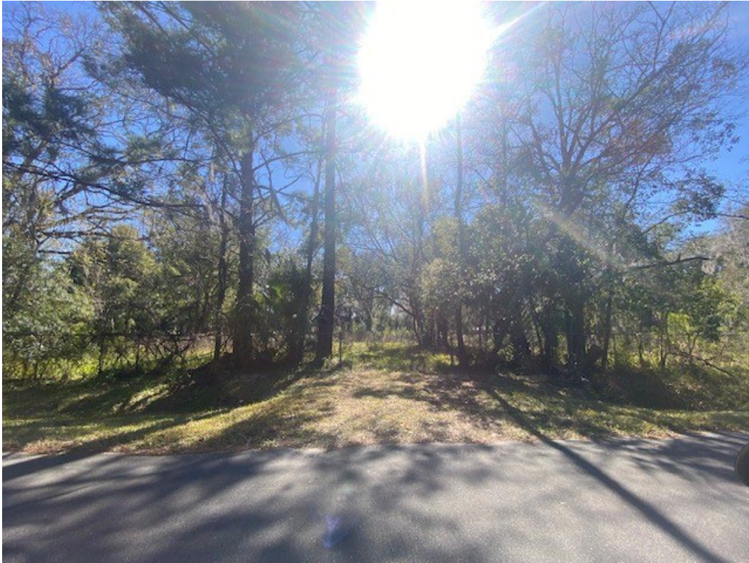
View of adjacent property recently rezoned to RMD-A.