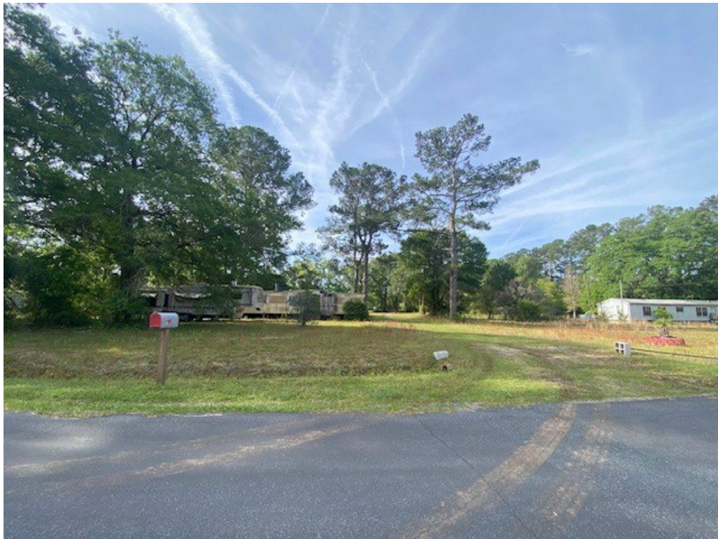
View of subject property