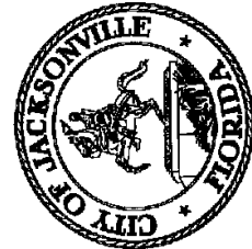
Exhibit 2 (Page 1 of 1)