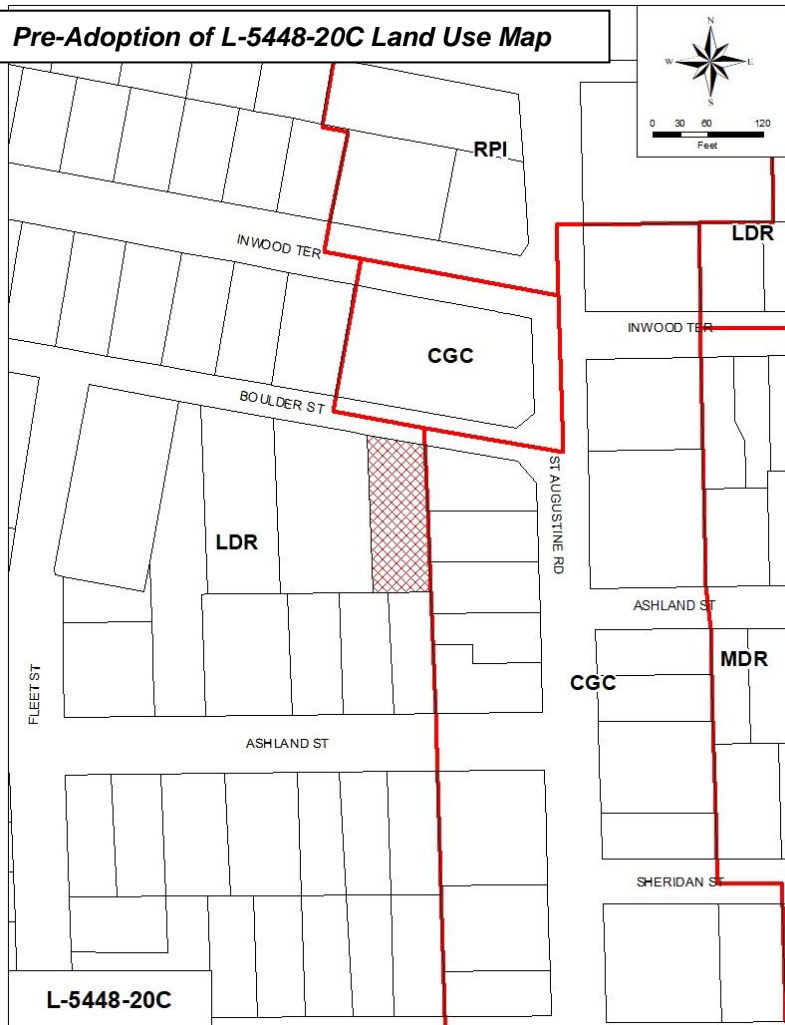
Pre-Adoption of L-5448-20C Land Use Map