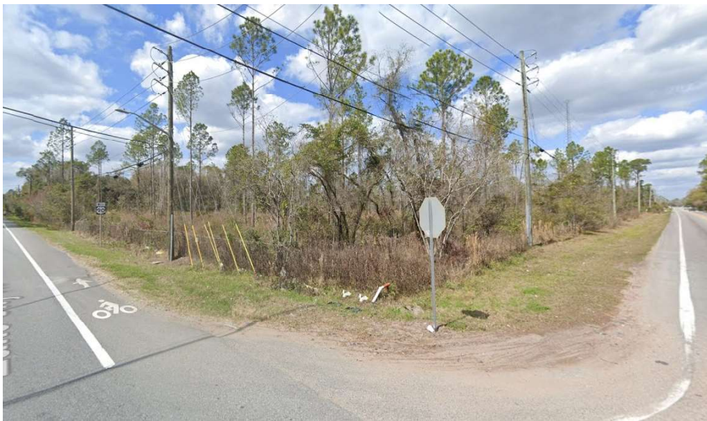
View of the Subject Site