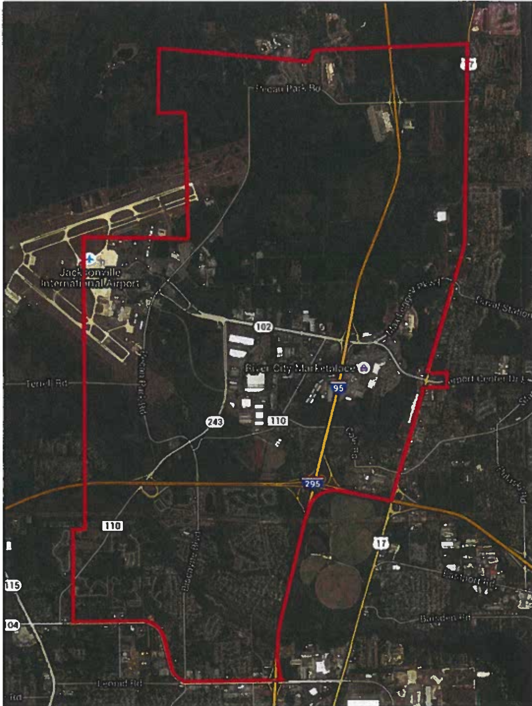
Exhibit A JIA CRA Boundary