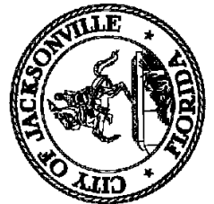
Exhibit 2 (Page 1 of 1)