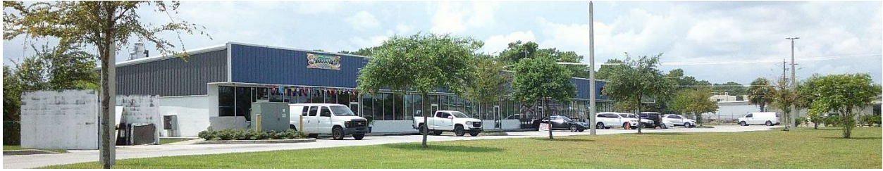
View of subject property