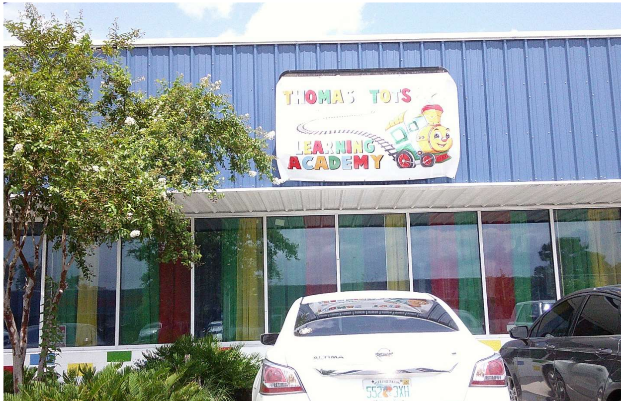
View of adjacent businesses