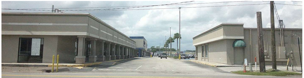
View of properties across the street