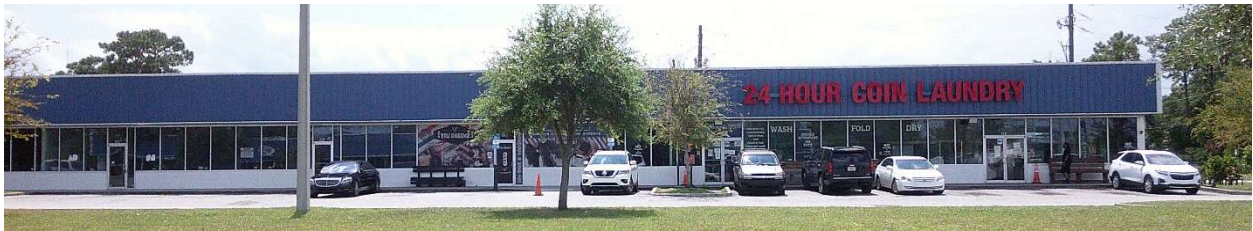
View of adjacent businesses