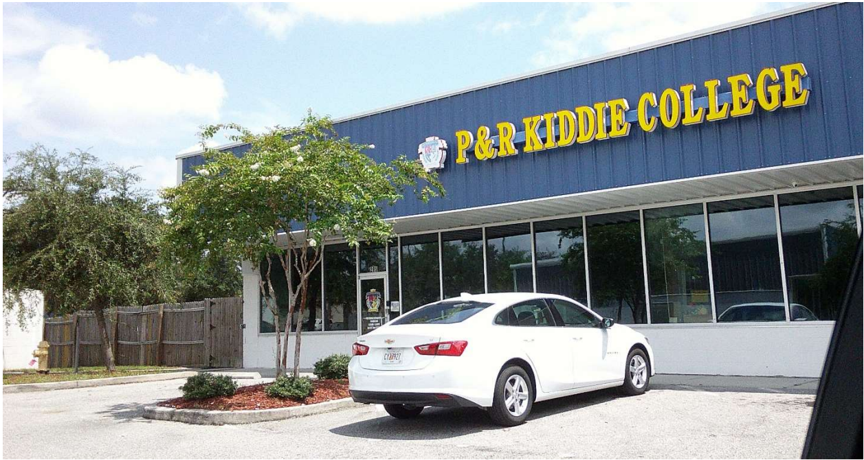
View of adjacent businesses