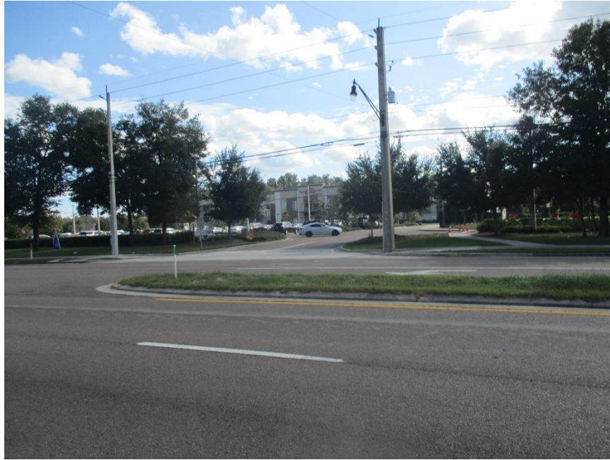
View of the neighboring charter school across 103 rd Street.