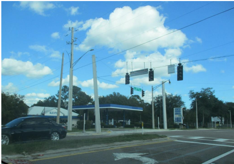
View of the neighboring filling station to the east of the subject property.