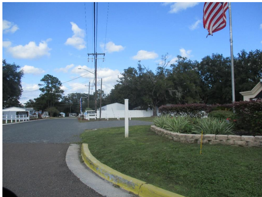
View of the mobile home park to the west of the subject property. Date: November 12, 2019