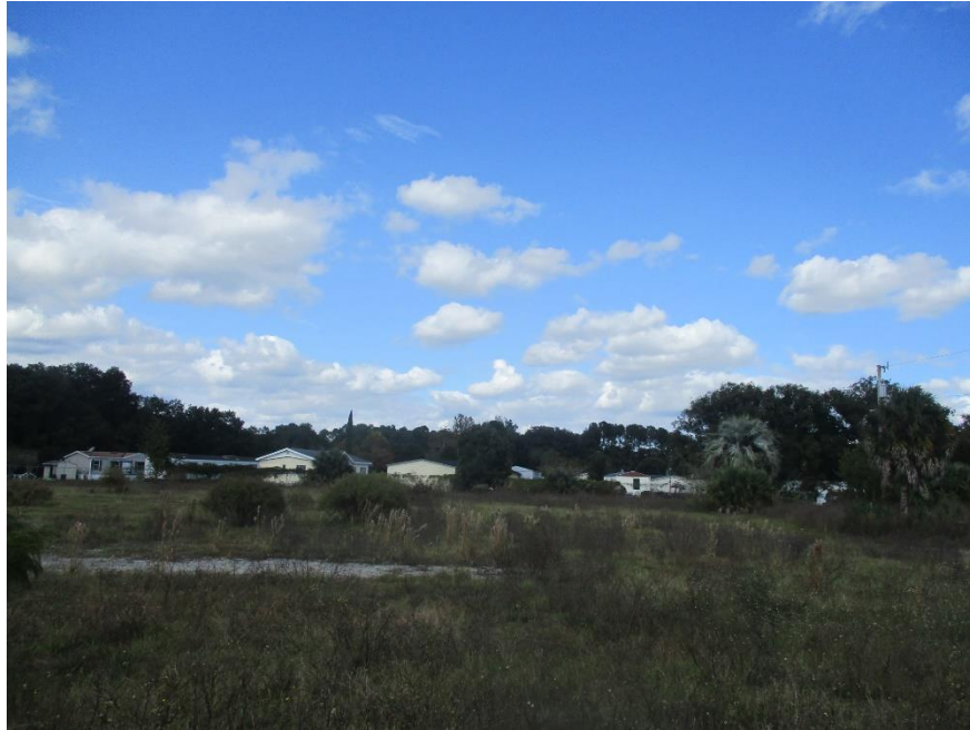
View of the subject property and the mobile home park to the north of the subject property. Date: November 12, 2019