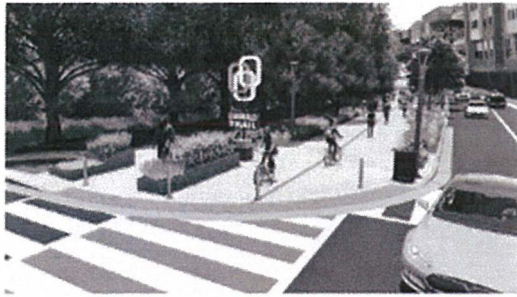
An artist's rendering of the Emerald Trail Pond & Company is the project architect.