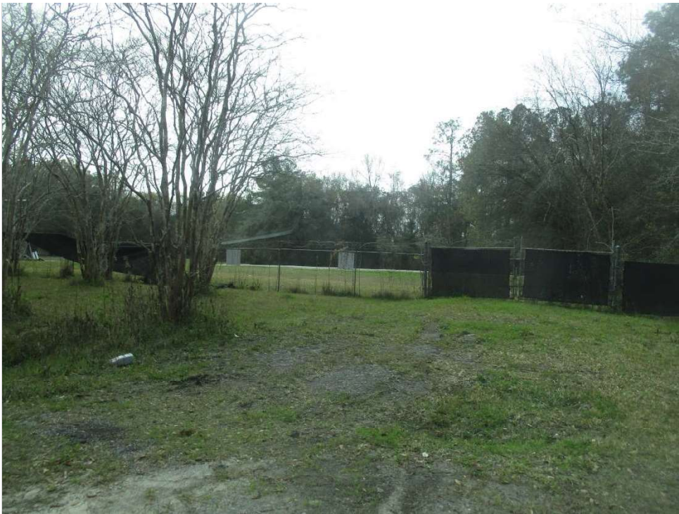
View of the neighboring airport parking service across Owens Road