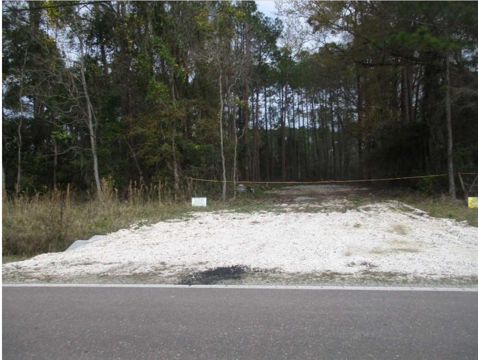
View of the Subject Site