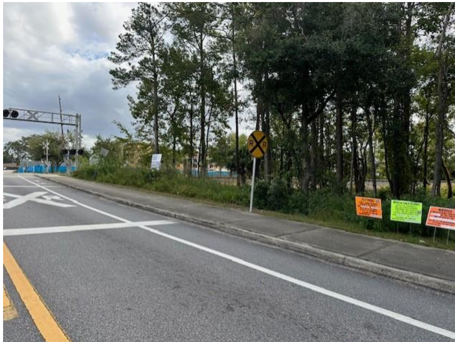
Source: Planning & Development Department, 10/24/2023 View of property, facing northeast, toward the CCG-2 Zoning District.