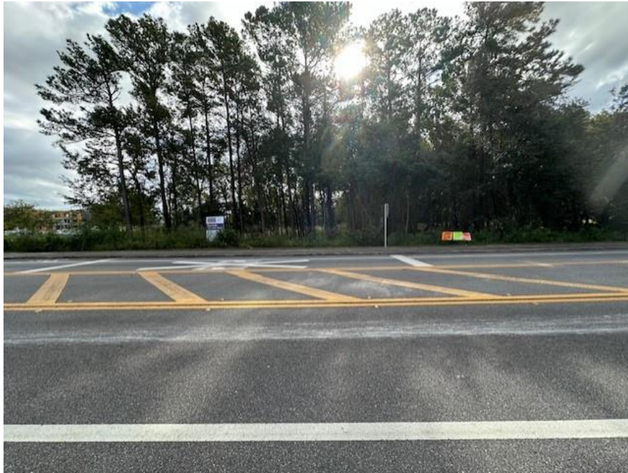
Source: Planning & Development Department, 10/24/2023 View of Subject Property.