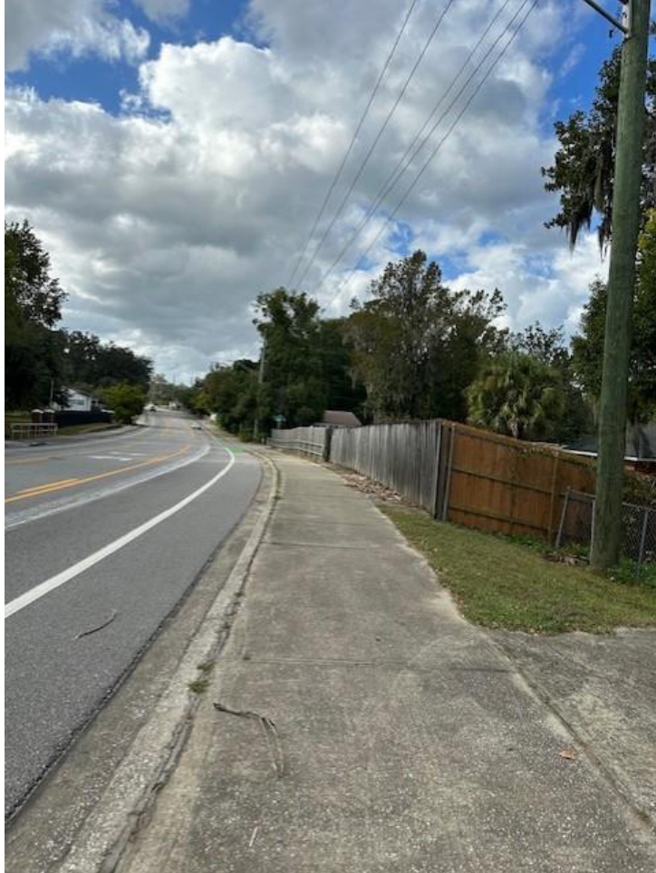
Source: Planning & Development Department, 10/24/2023 View of property, facing southwest, toward the RLD-60 Zoning District.