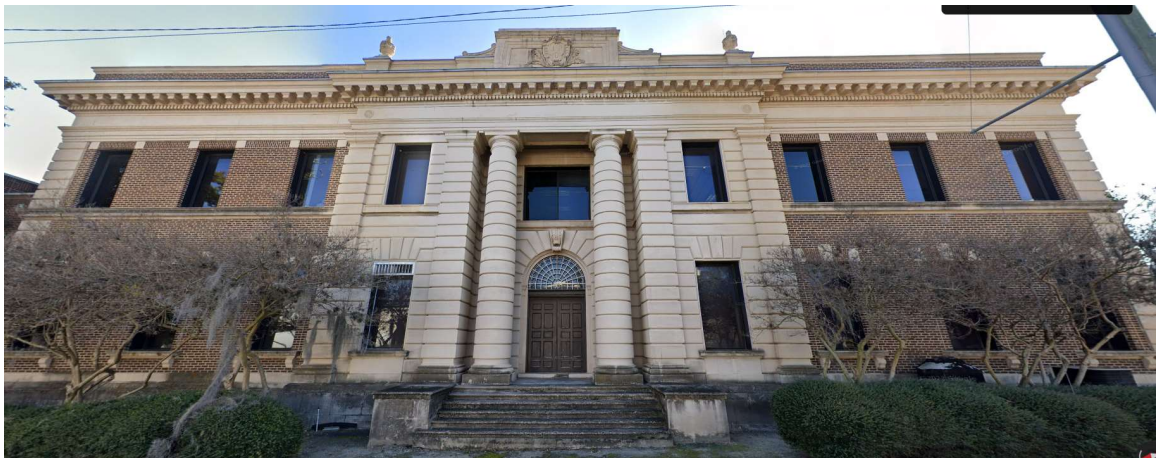
View of the Building's Main Entrance