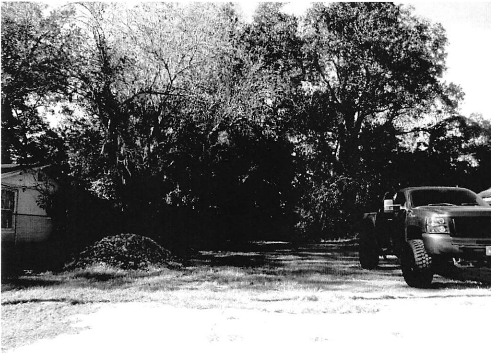
View of the Subject Site

Upon visual inspection of the subject property on October 24, 2022 by the Planning and Development Department the required Notice of Public Hearing sign was not posted.