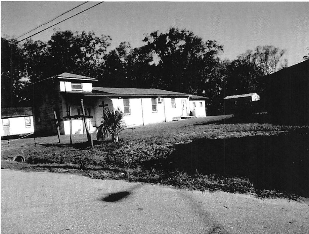
View of the Church across the street from the subject site.