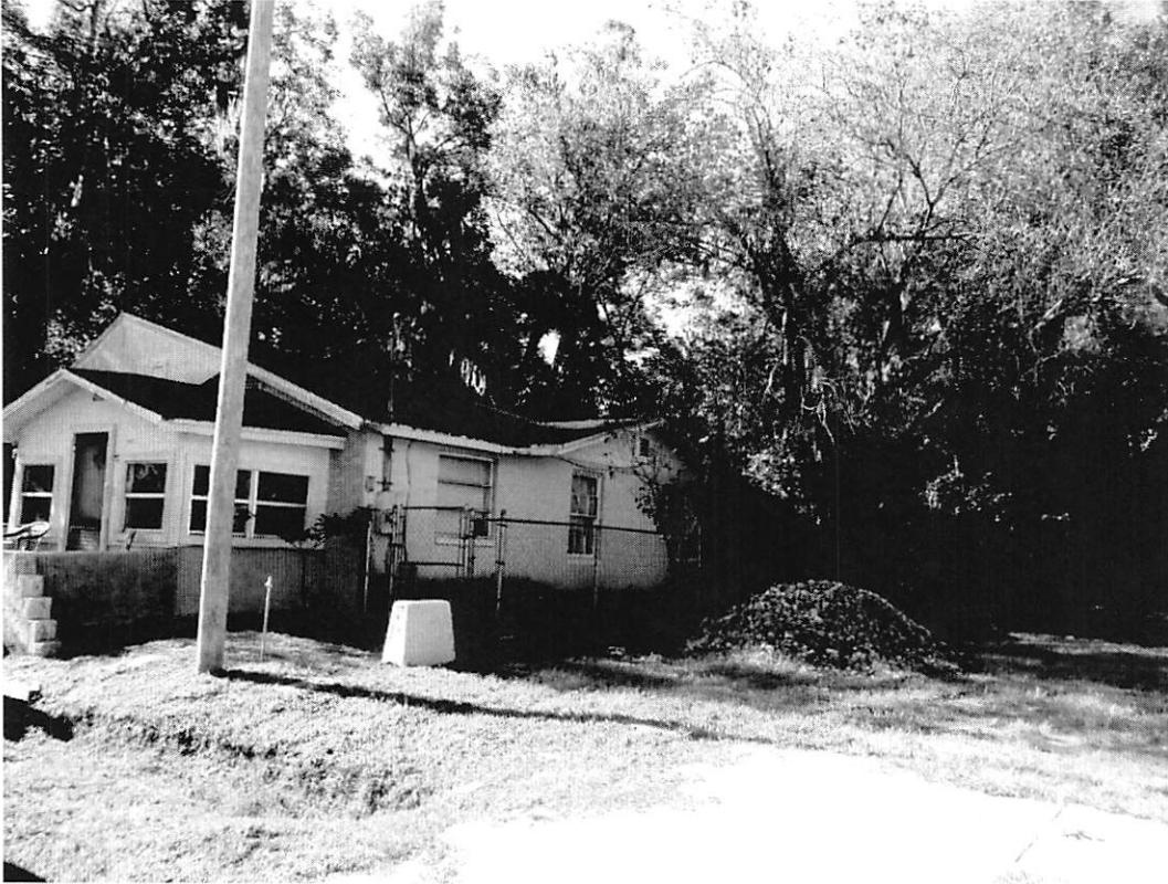
View of the neighboring house to the south