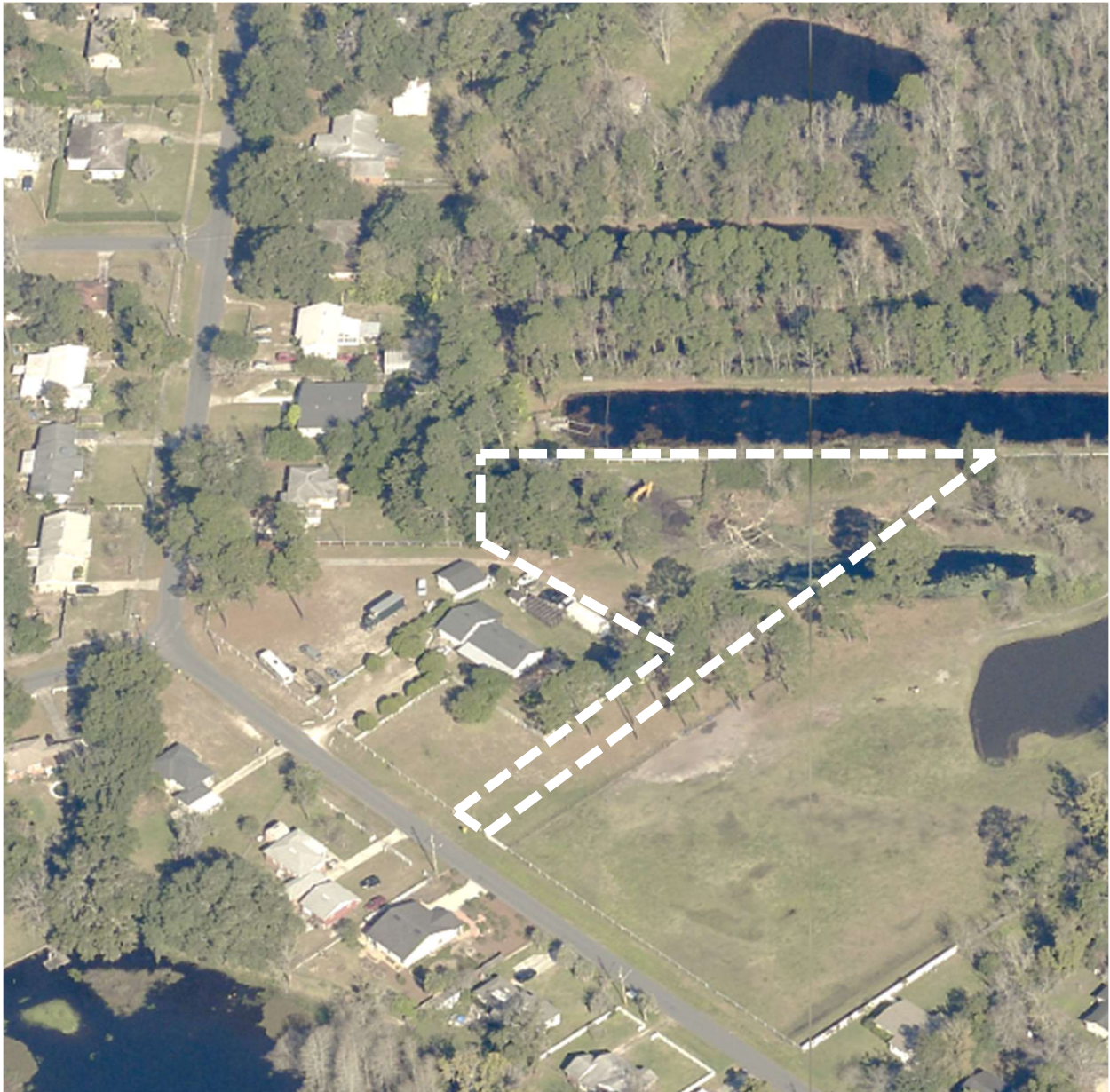
Aerial view of subject property