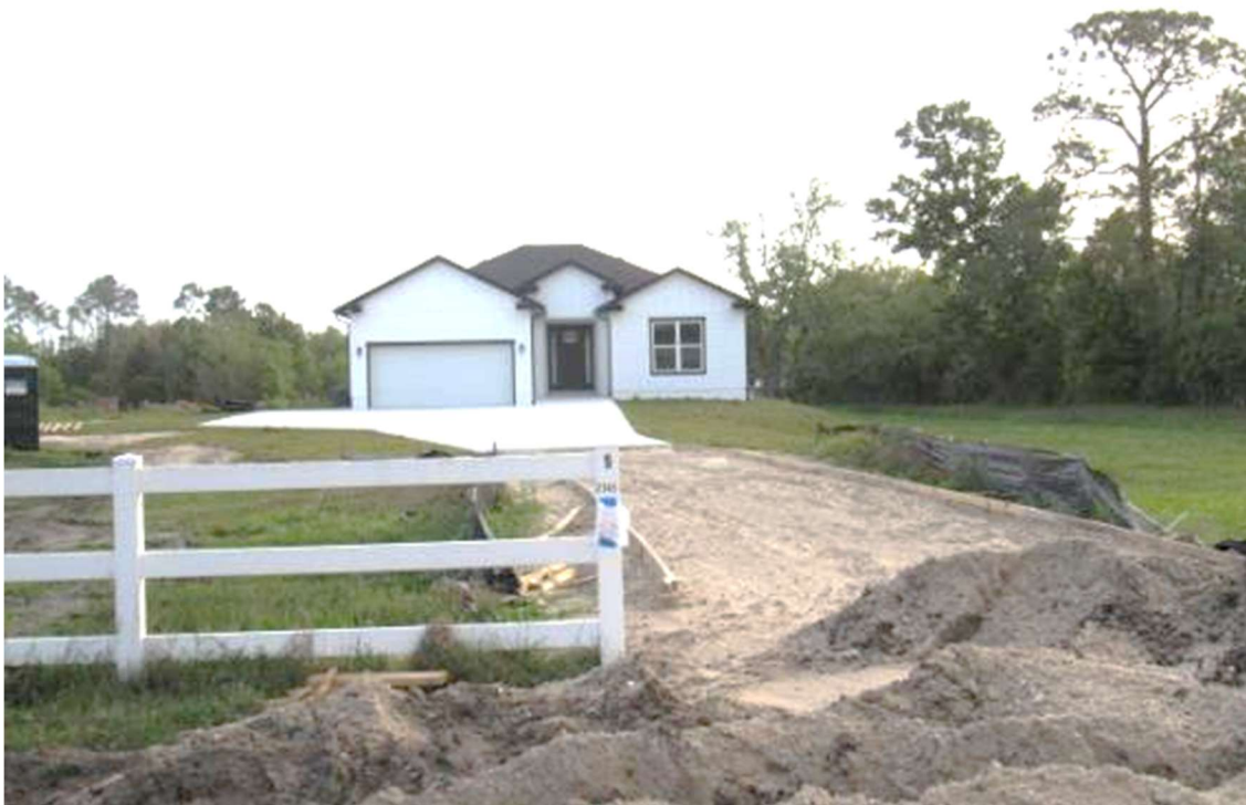
View of adjacent property