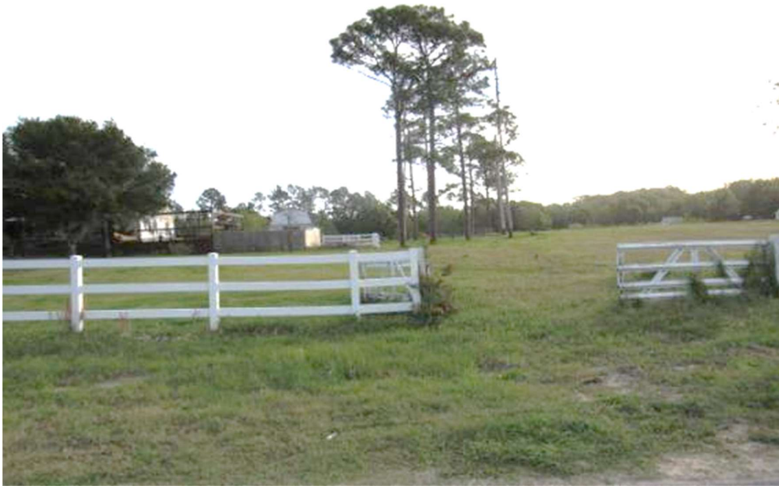
View of subject property