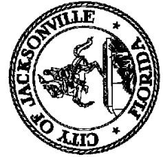
Exhibit 2 (Page 1 of 1)