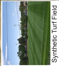
Synthetic Turf Field

Blue Cypress Regional Park City of Jacksonville Parks, Recreation & Community Services