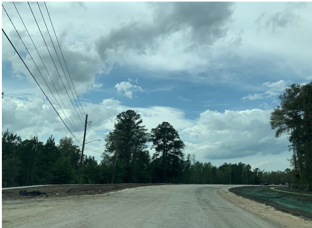
View looking towards the Subject Property.

Date: March 23, 2020