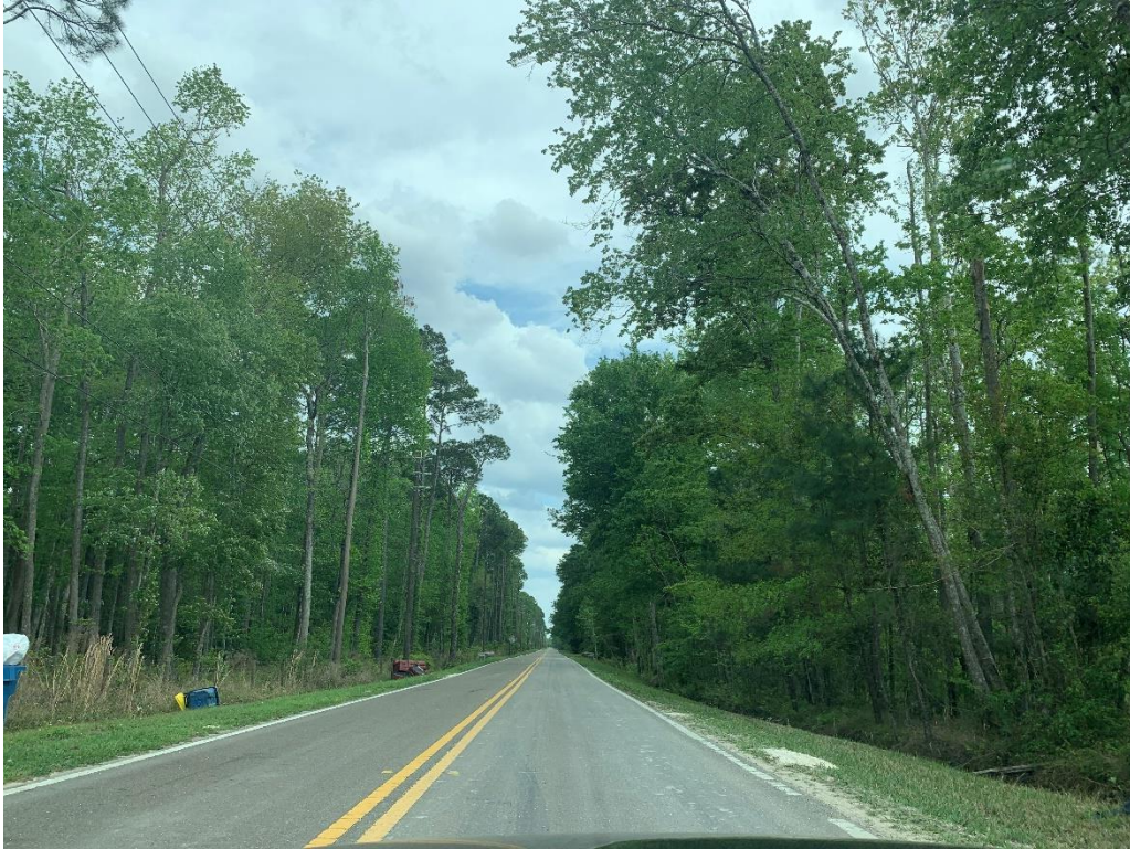
View of the looking down Arnold Road looking away from the Subject Site.