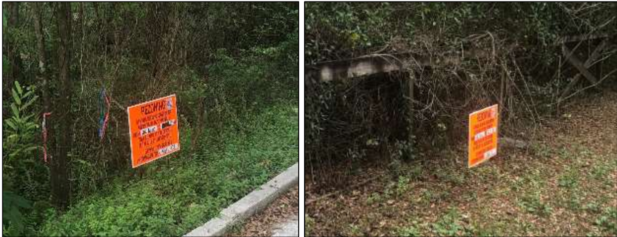
February 18, 2020

Upon visual inspection of the subject property on February 13, 2020 by the Planning and Development Department, the required Notice of Public Hearing signs were not posted. However, the owner promptly followed up and reposted the sign.