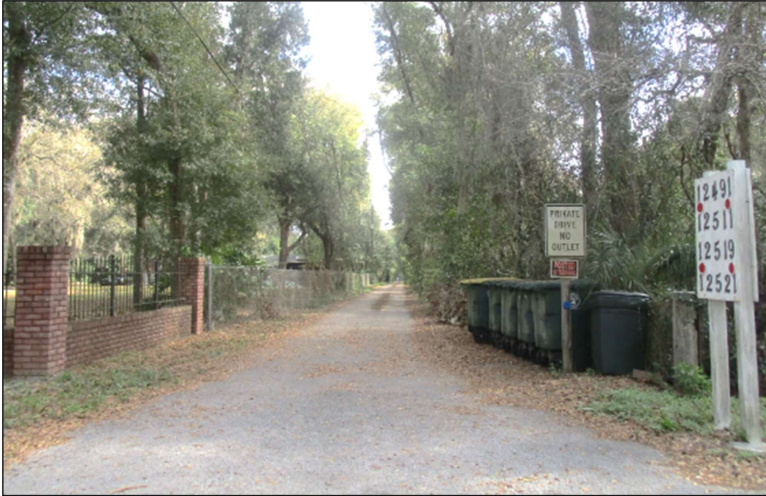
View of Subject Property along Aladdin Road