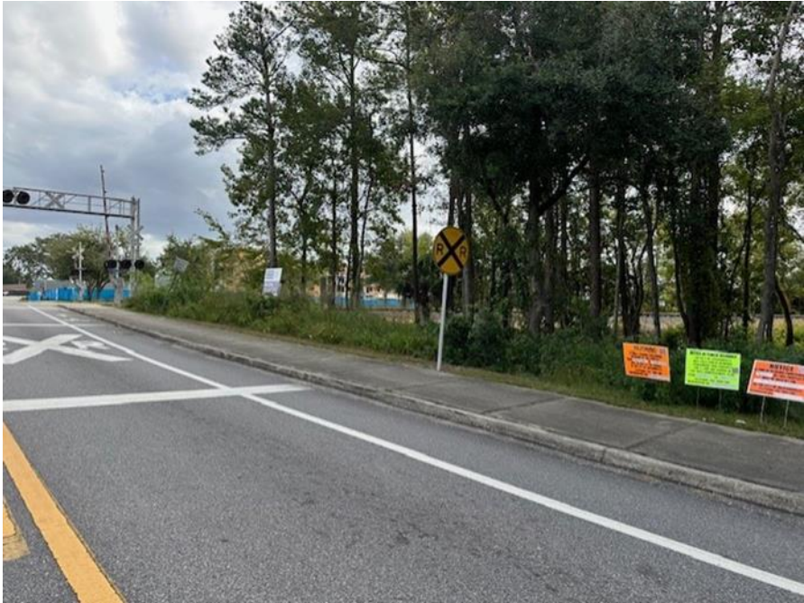
Source: Planning & Development, 10/24/2023 View of property, facing northeast, toward the CCG-2 Zoning District.