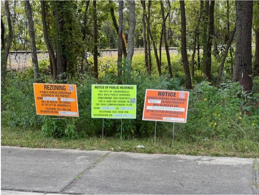
The required notice of public hearing sign was posted.