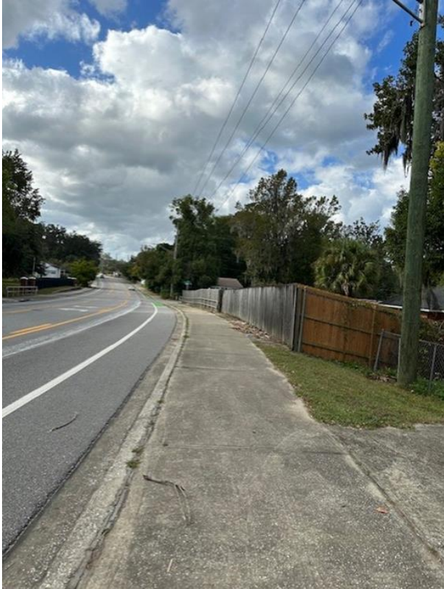
Source: Planning & Development Department, 10/24/2023 View of property, facing southwest, toward the RLD-60 Zoning District.