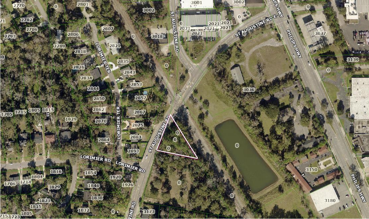
Source: Planning & Development, 10/26/2023 Aerial view of the subject property, facing north.