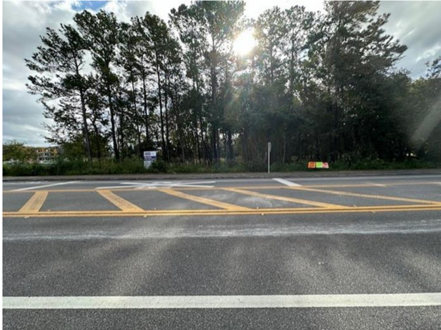
Source: Planning & Development, 10/24/2023 View of the subject property, facing east.