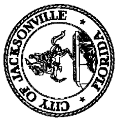
Exhibit 2 (Page 1 of 1)