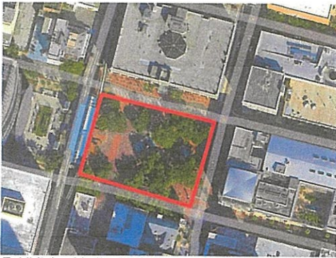
Exhibit A – Limits of Work

The project site, approximately 2 acres in size, is located in Jacksonville, Florida across from the Jacksonville City Hall, bound by W Duval, N Laura, Monroe and Hogan Streets. Formerly named Hemming Park, The City of Jacksonville recently removed a statue of Hemming and renamed the park after James Weldon Johnson. The Park currently serves daytime workers in the area, hosts events and contains rotating and permanent public art. With its recent re-naming, project stakeholders hope to use this opportunity to not only rejuvenate the park's facilities, but also consider its place within the history and culture of Jacksonville and its residents. This initial effort will address both the functional and sociocultural aspects of the park in The James Weldon Park Vision Plan. Through the process, HDS will liaise with the client group(s) and identify community groups to develop an aspirational future for the park. The final deliverable will be schematic in nature, so that the design and its graphics can be used both for fundraising and cost estimating. HDS assumes work for this effort will be limited to within the curb lines of the Park and will not extend into the roadway or adjacent streetscape areas