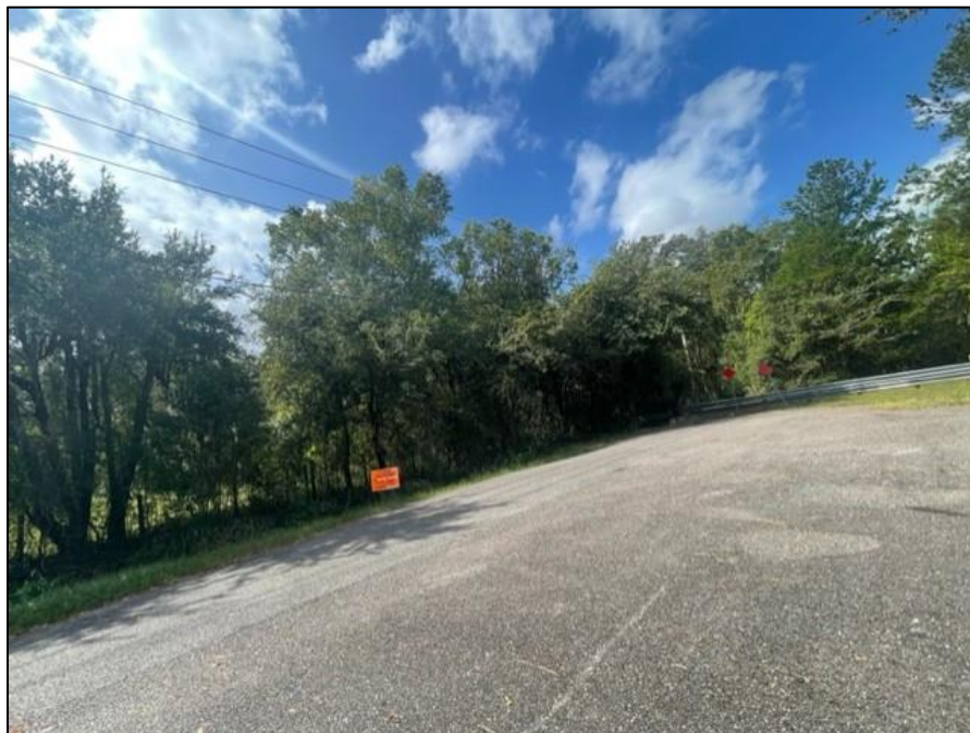
Western View of the Subject Property and adjacent ROS from Morse Avenue Source: Planning and Development Department, 10/2/2023