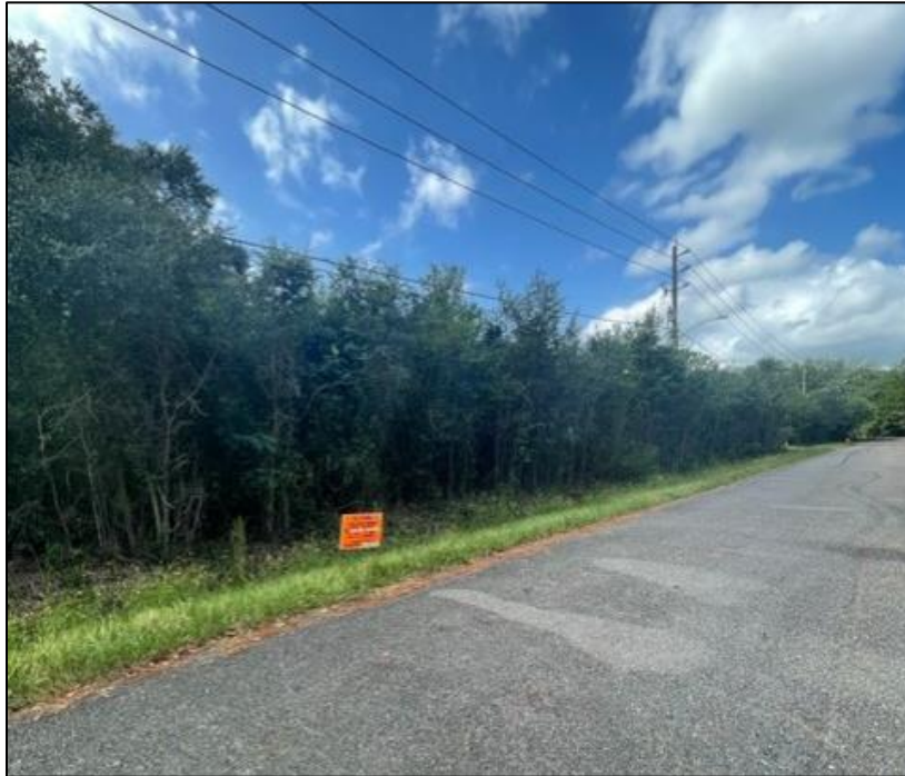
View of the Subject Property from Morse Avenue