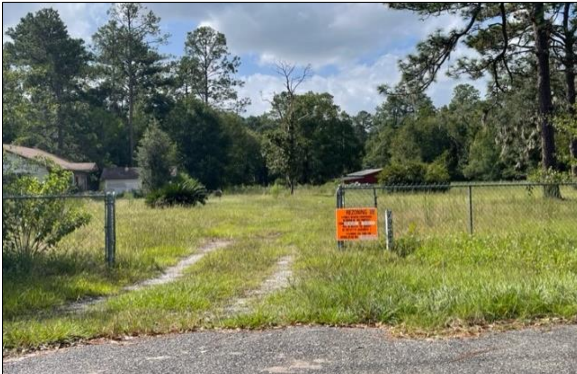
View of the entrance of the Subject Property from Morse Avenue Source: Planning and Development Department, 10/2/2023