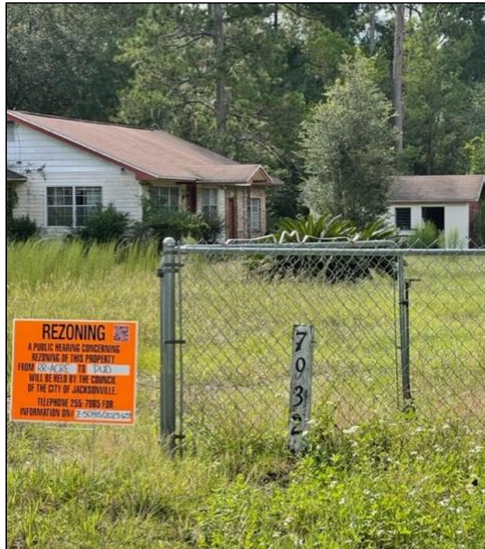
View of structures on the Subject Property from Morse Avenue Source: Planning and Development Department, 10/2/2023