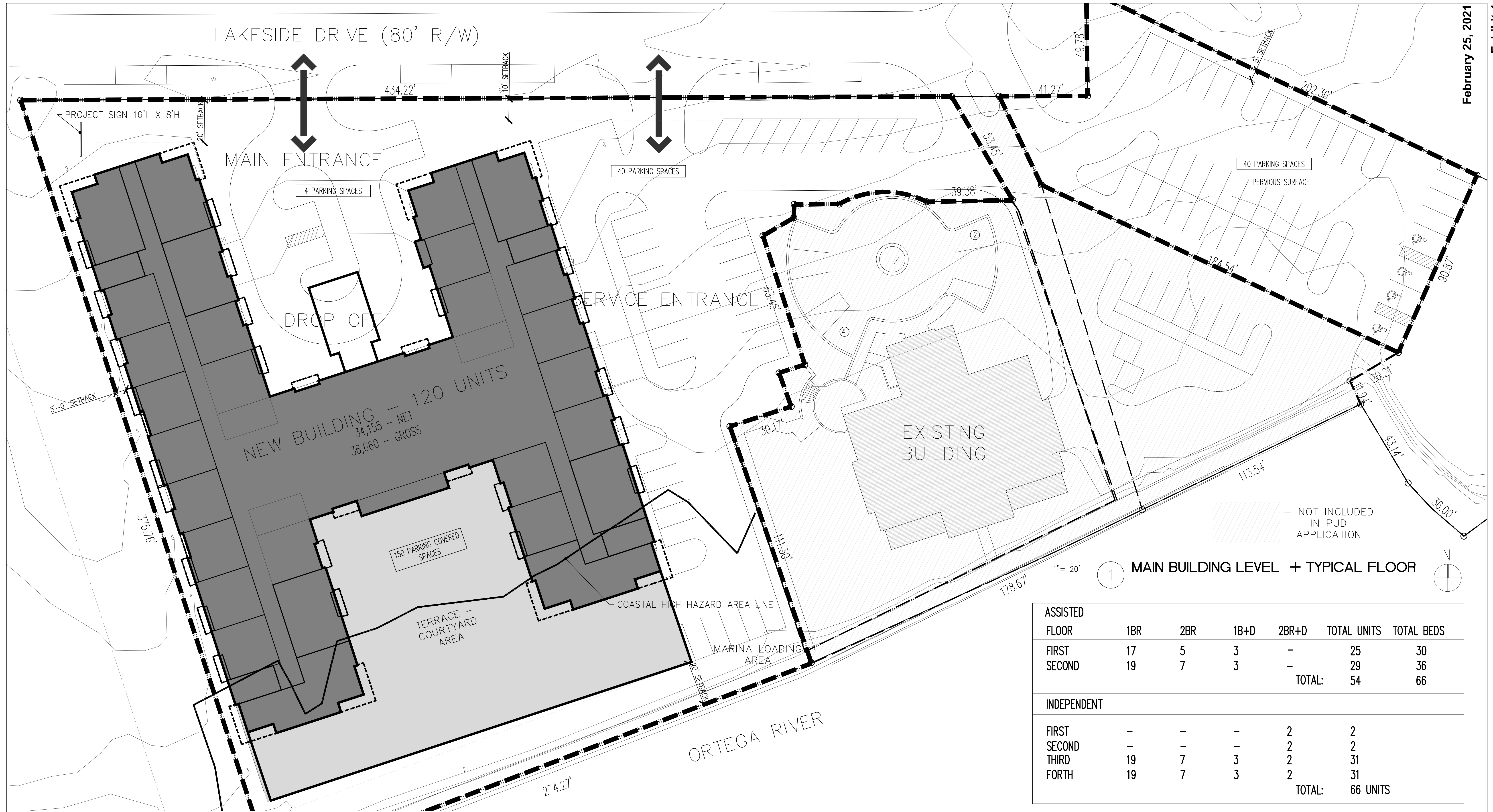
1" = 20' 1 MAIN BUILDING LEVEL + TYPICAL FLOOR