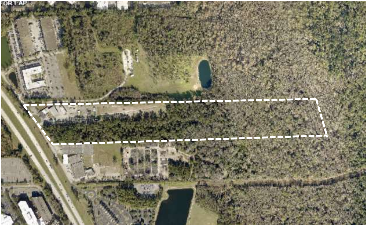
Aerial view of subject property