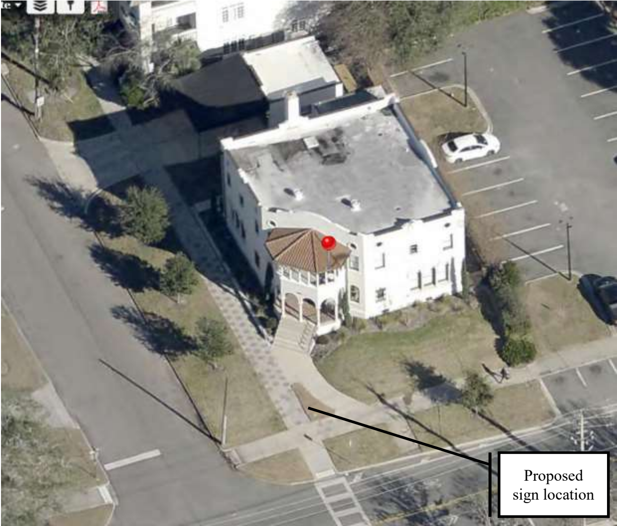
Aerial view of subject property