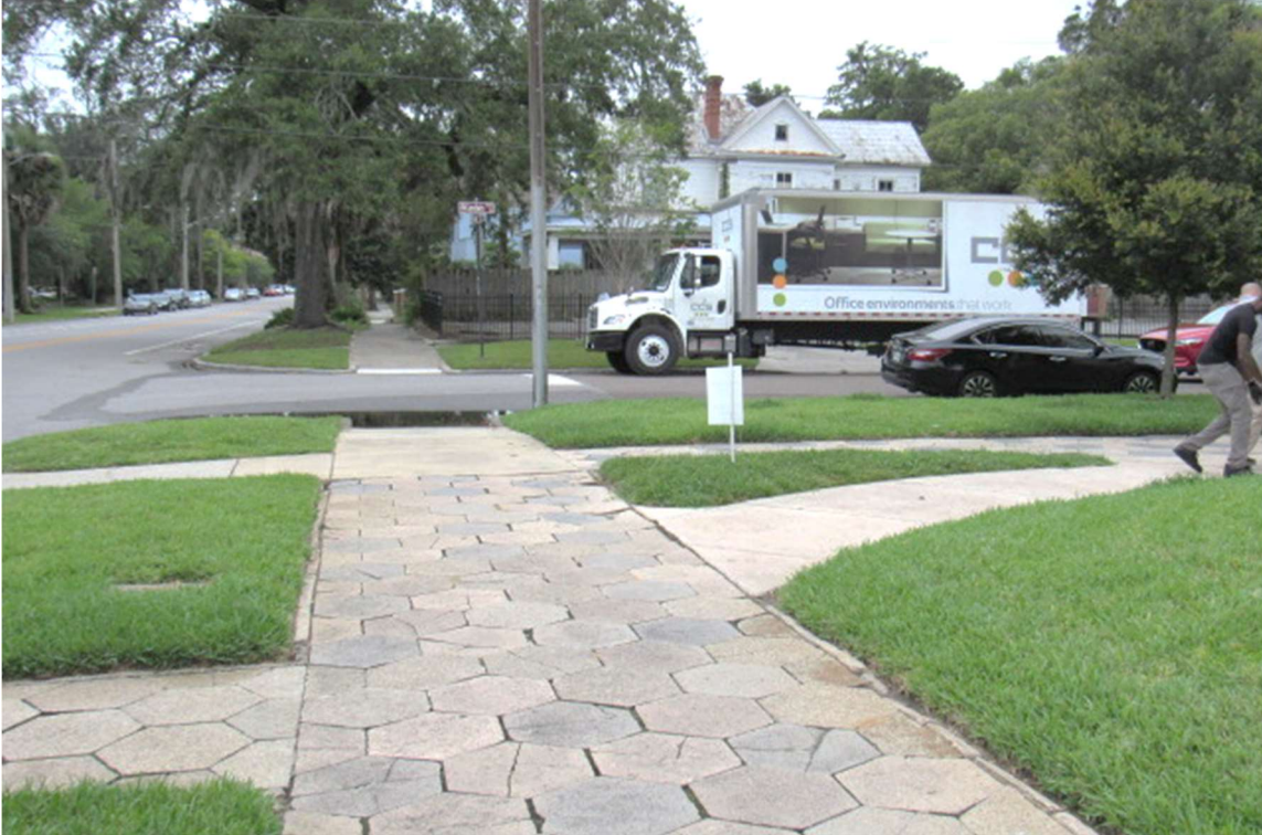
View of sign location