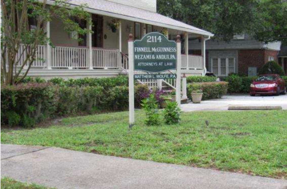
Similar sign across from subject property.