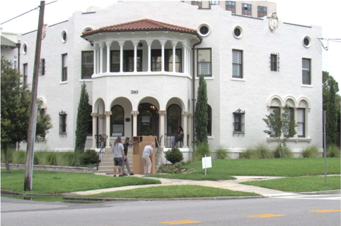
View of subject property