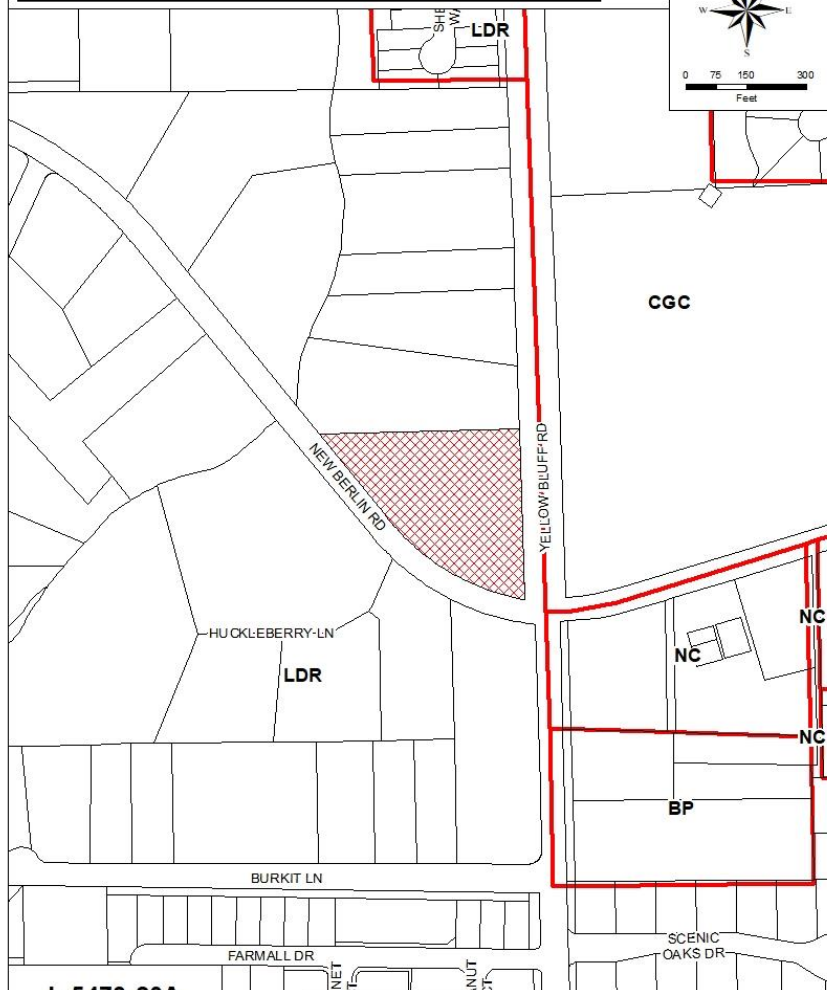
Pre-Adoption of L-5473-20C Land Use Map