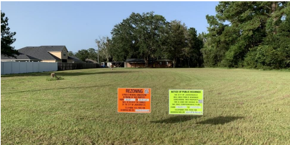
View of the Subject Site