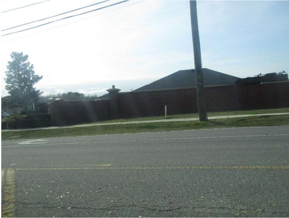
View of the neighboring subdivision