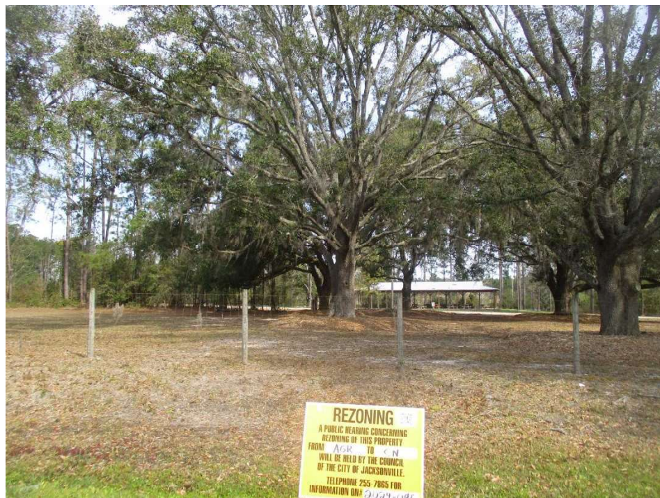
View of the Subject Site