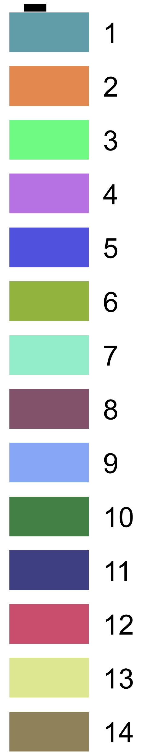
EXHIBIT 1: PLAINTIFF 3 - "P3"