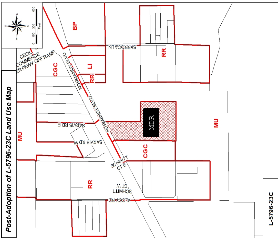
Post-Adoption of L-5796-23C Land Use Map