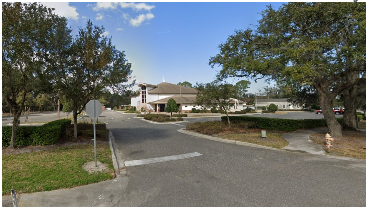
View of the Dunn's Creek Baptist Church, located north of the subject property.