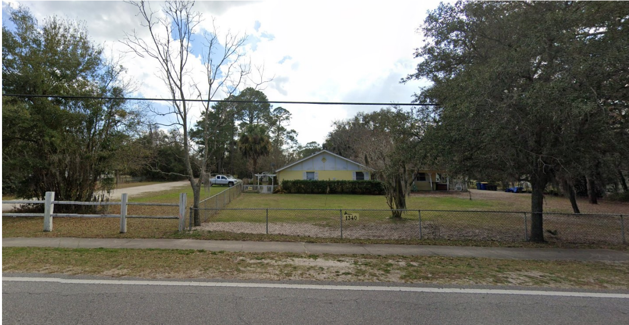
View of the subject property from Starratt Road.