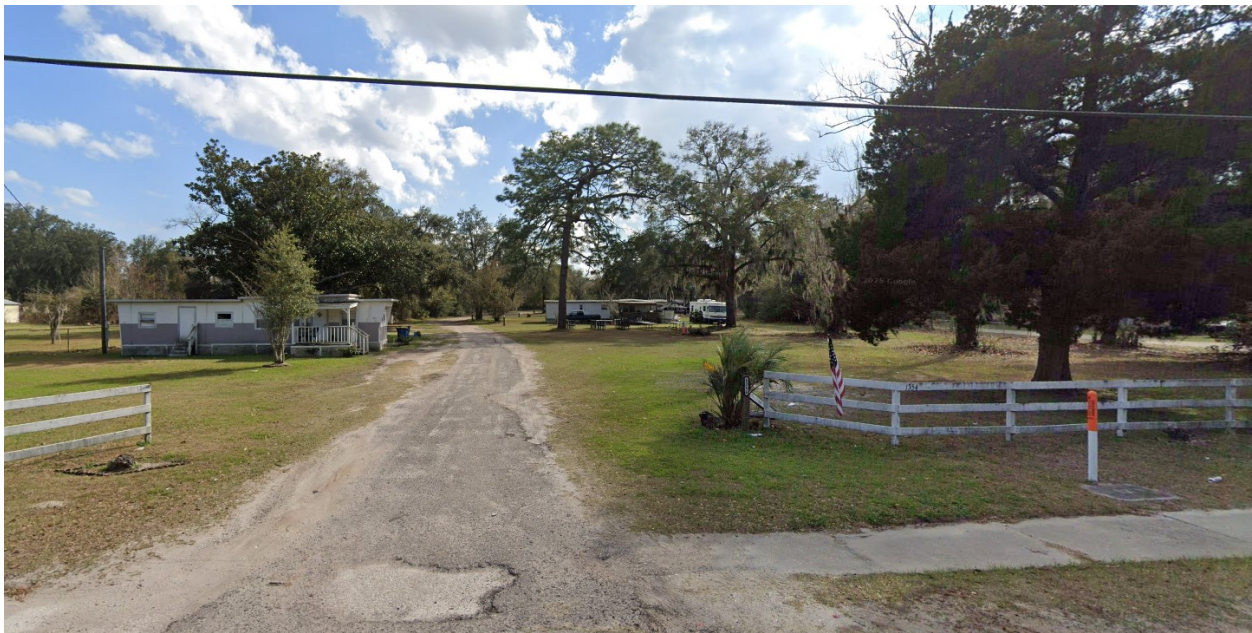
View of the subject property from Starratt Road.