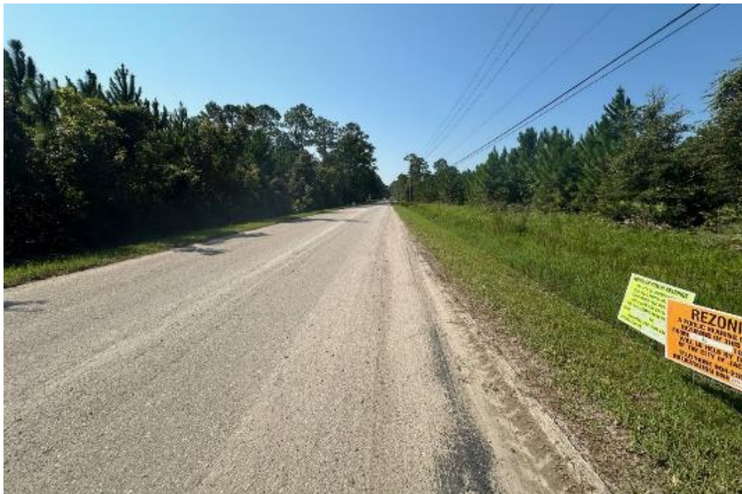
View of Proposed Properties