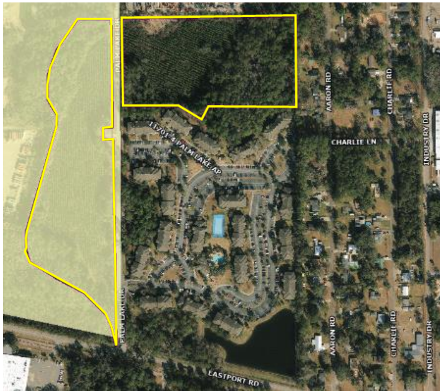
Industrial Situational Compatibility Zone Map

No. Staff finds that the proposed rezoning application and land use amendment are not in conflict with the City's land use regulations. The applicant seeks to rezone the property from IL and IBP to RMD-A and RMD-D and change the land use category from LI and BP to MDR.