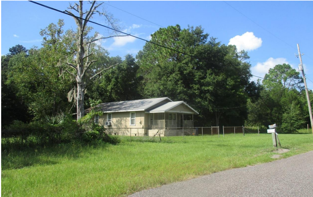
View of Property to the South