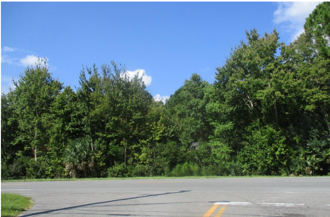
View of Property to the West