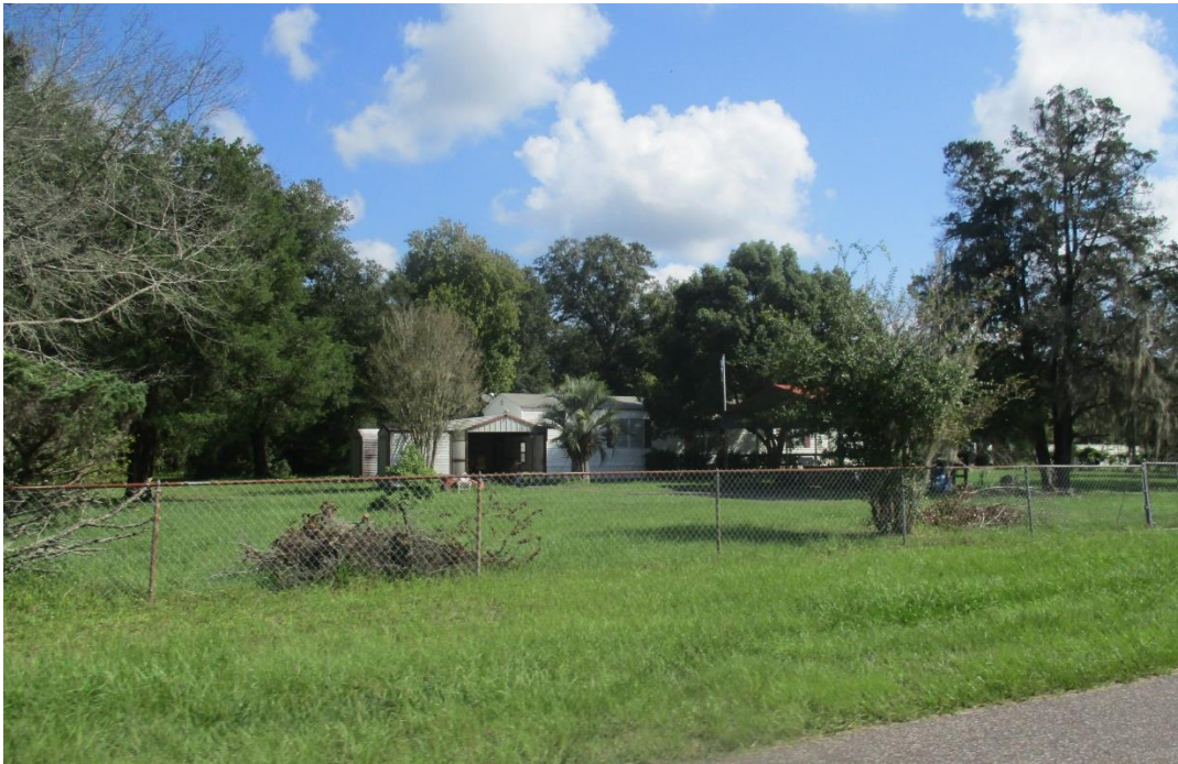
View of Properties to the East