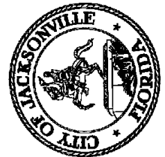
Exhibit 2 (Page 1 of 1)