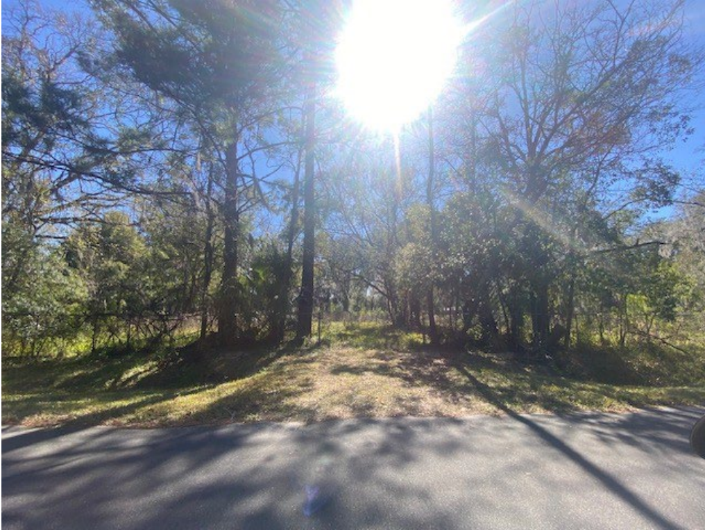
View of subject property