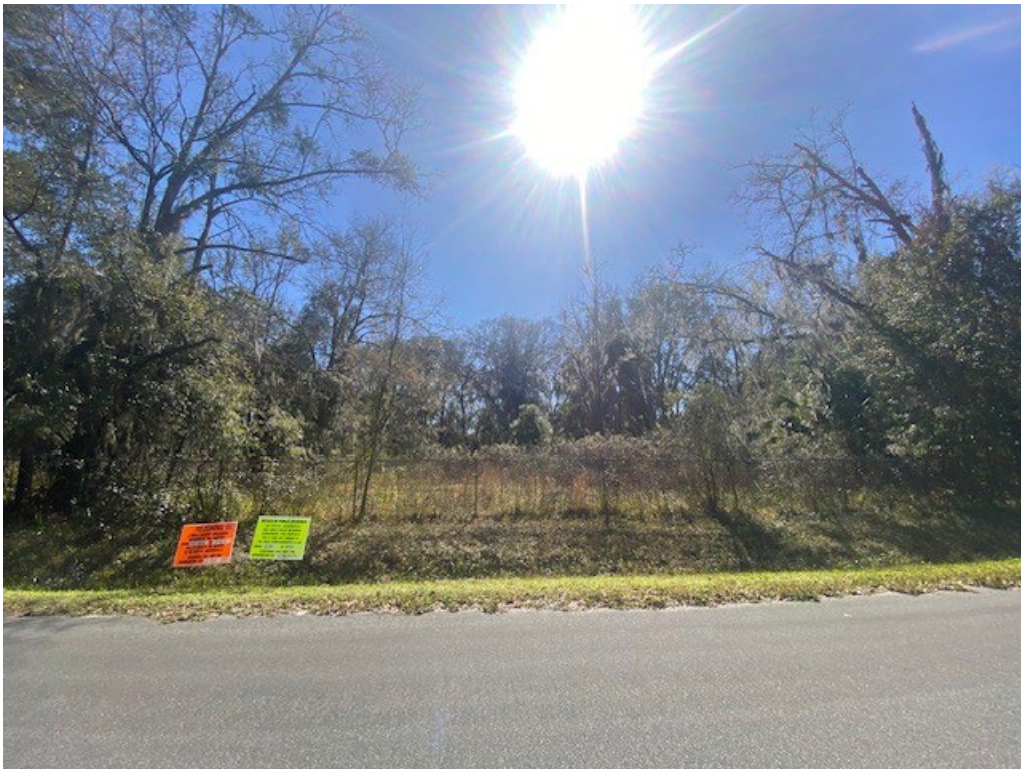
View of subject property.