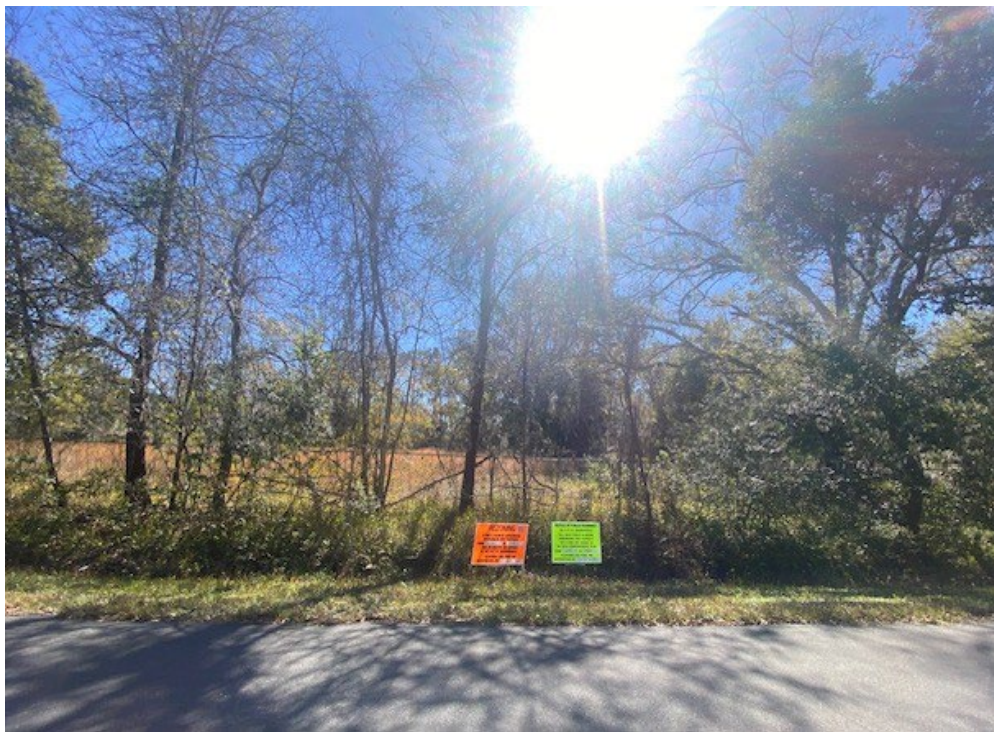
View of subject property

Based on the foregoing, it is the recommendation of the Planning and Development Department that Application for Rezoning Ordinance 2024-0057 be APPROVED .