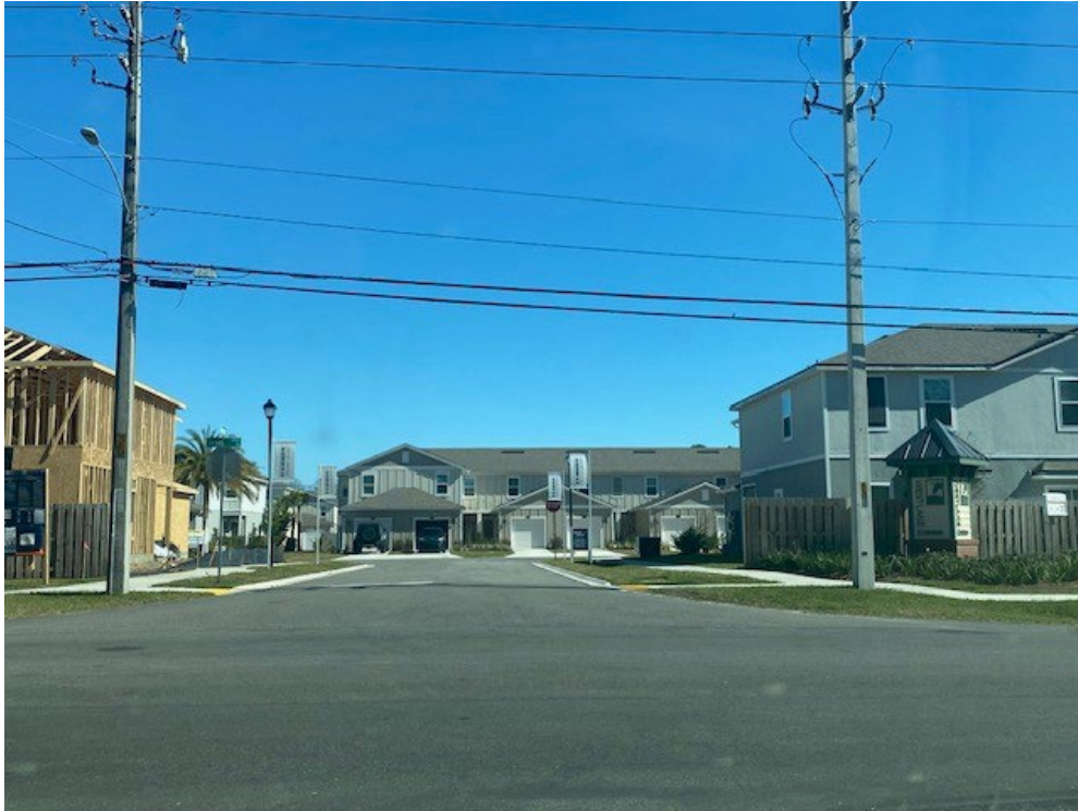
View of subject property developed with townhomes to the east.