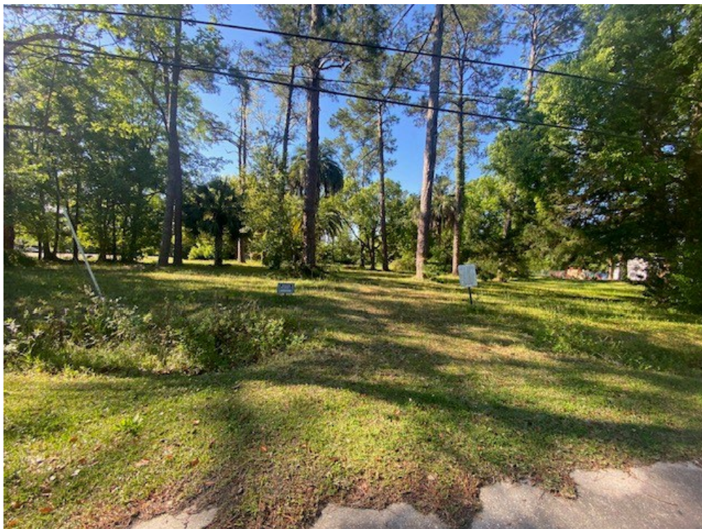
View of the Subject Property from Shelby Avenue.