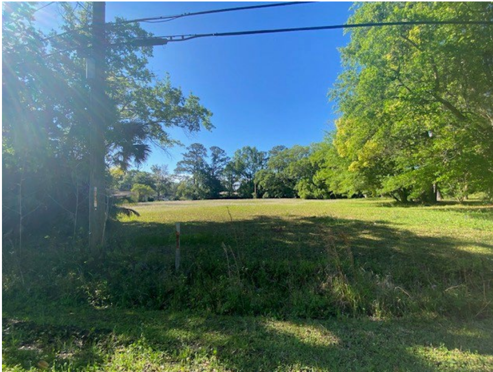
View of the Subject Property from Shelby Avenue.