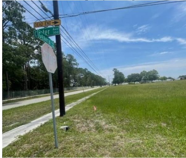
View of Property facing east

Date: 7/6/2023