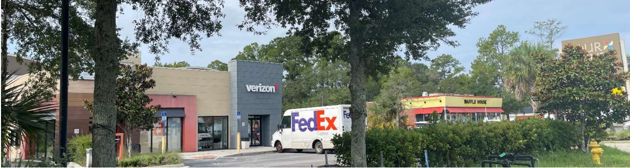
View of Adjacent Properties