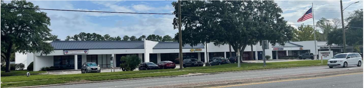
View of Properties Across the Street