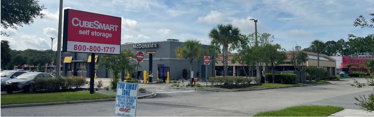
View of Adjacent Properties