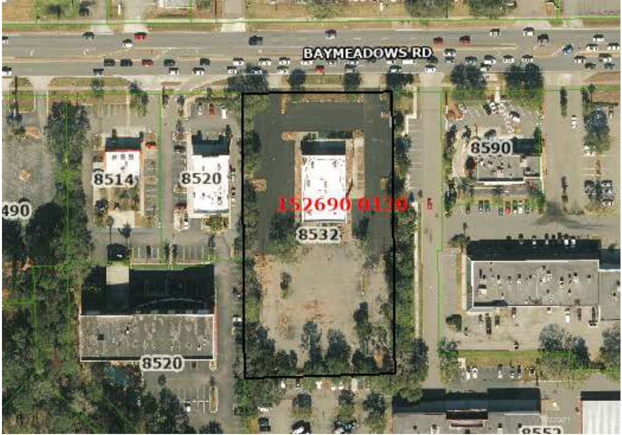
Aerial View of Subject Property