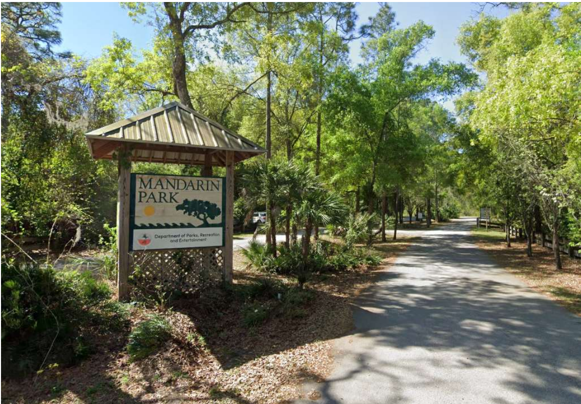
Entrance to the park