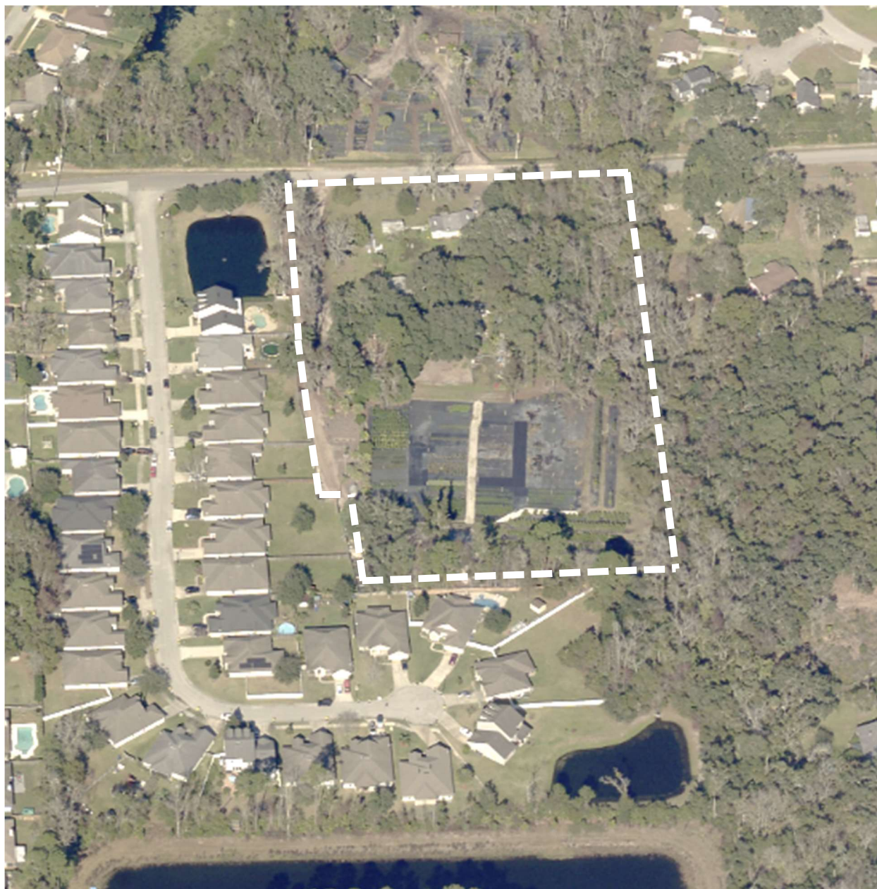
Aerial view of subject property