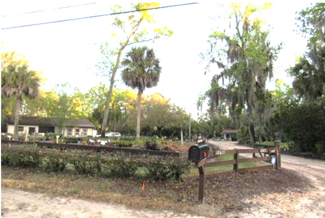
Plant nursery across from subject property