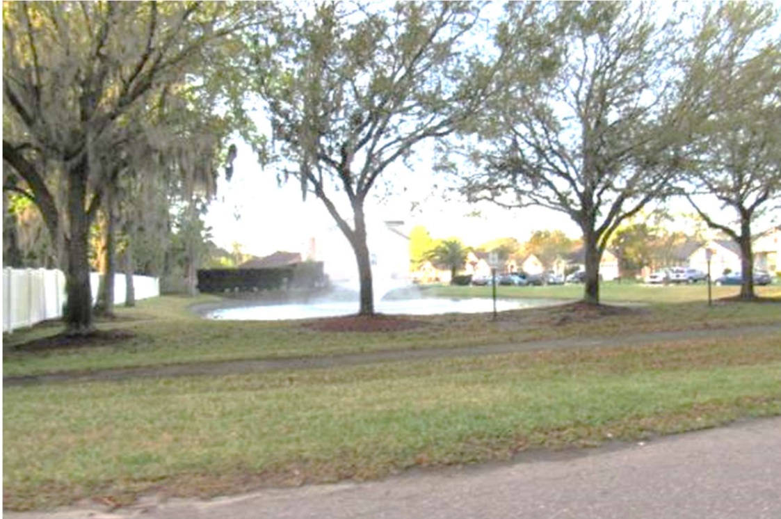
Retention pond adjacent to subject property