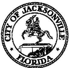
Exhibit 2 (Page 1 of 1)