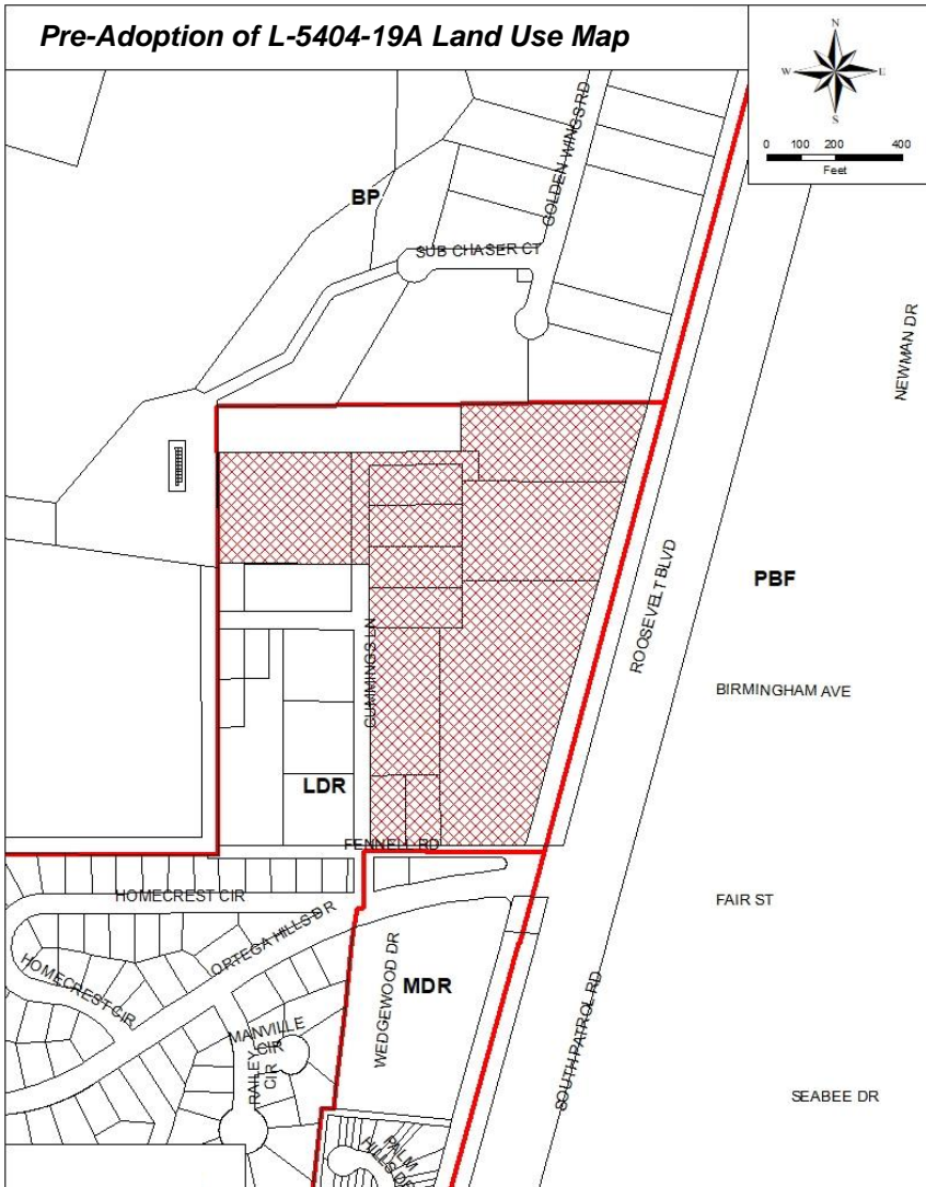
Pre-Adoption of L-5404-19A Land Use Map