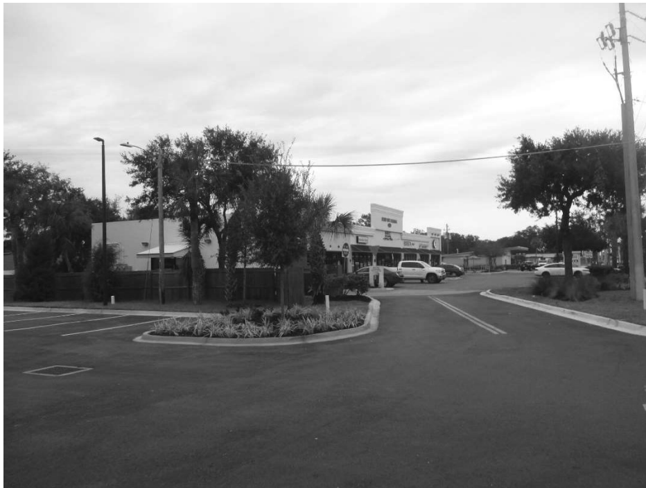
View of the neighboring parcel to the north that shares cross access.