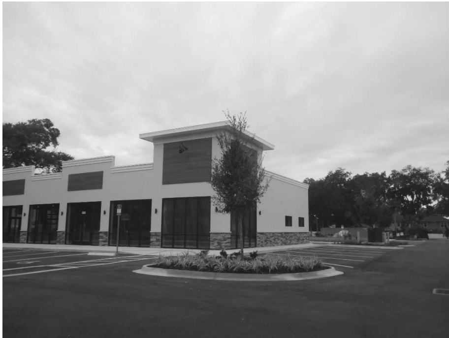
View of the Subject Site