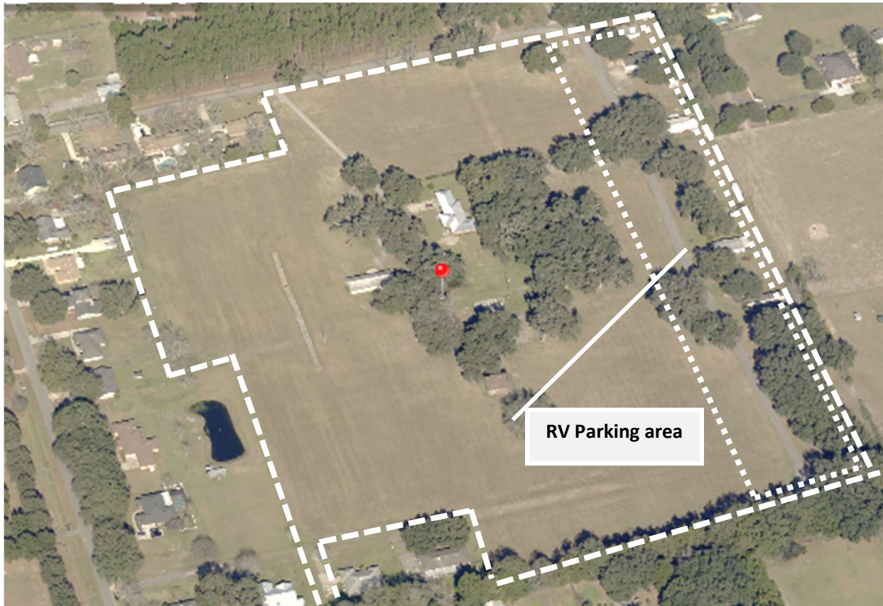
Aerial view of the subject property