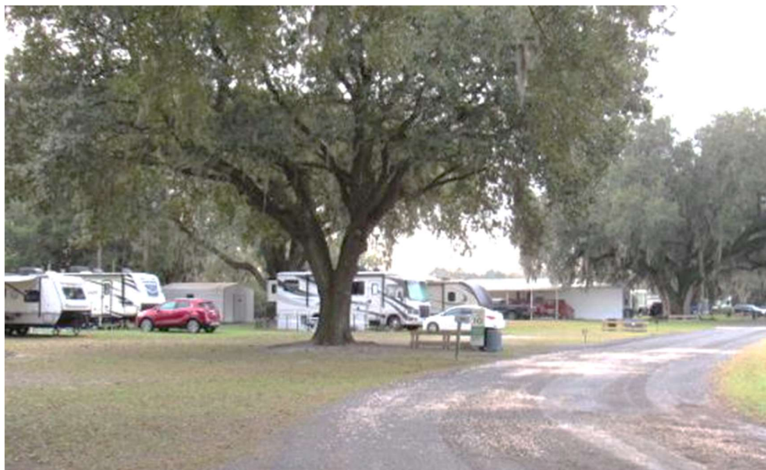
View of existing RVs already on the property