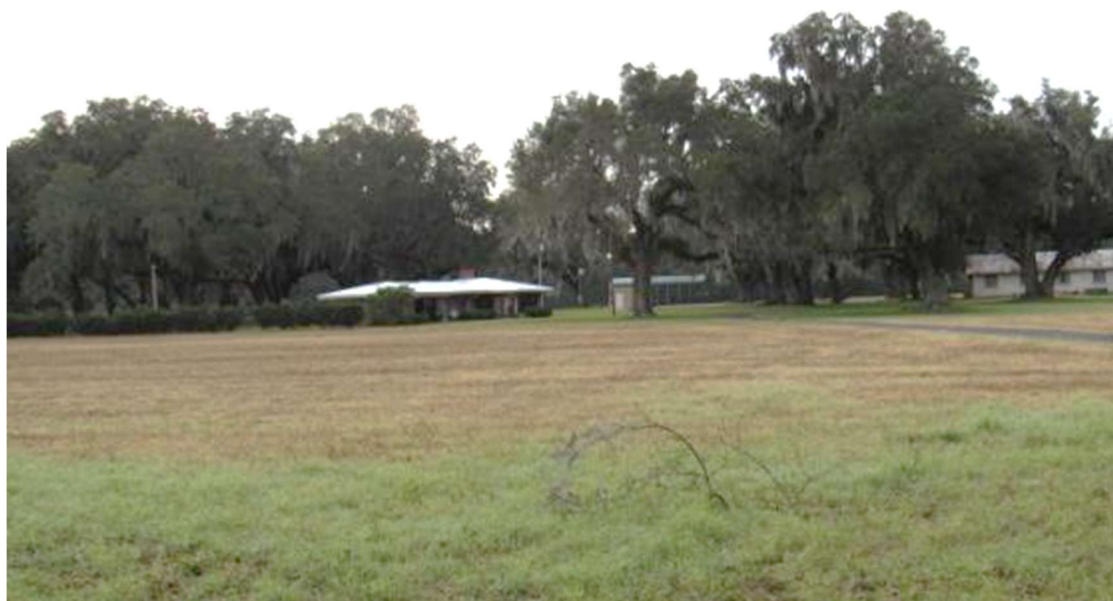
View of existing single family dwelling on the subject property