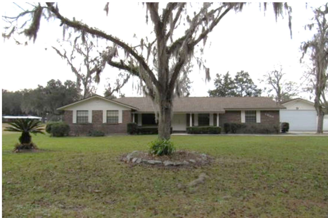
Adjacent single family dwelling