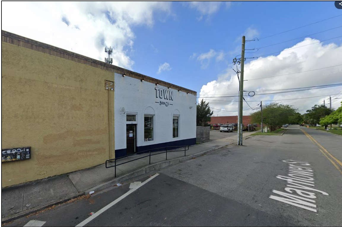
View of subject property from Mayflower Street