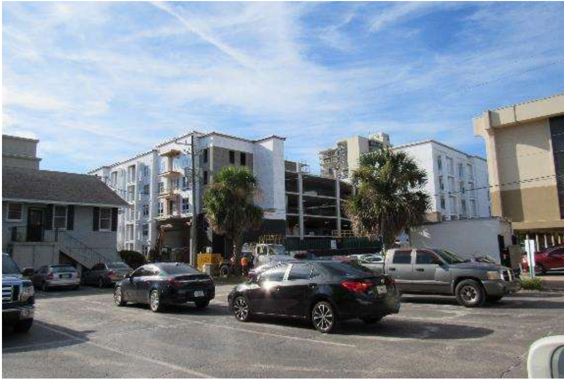
View of multi-family dwellings under construction