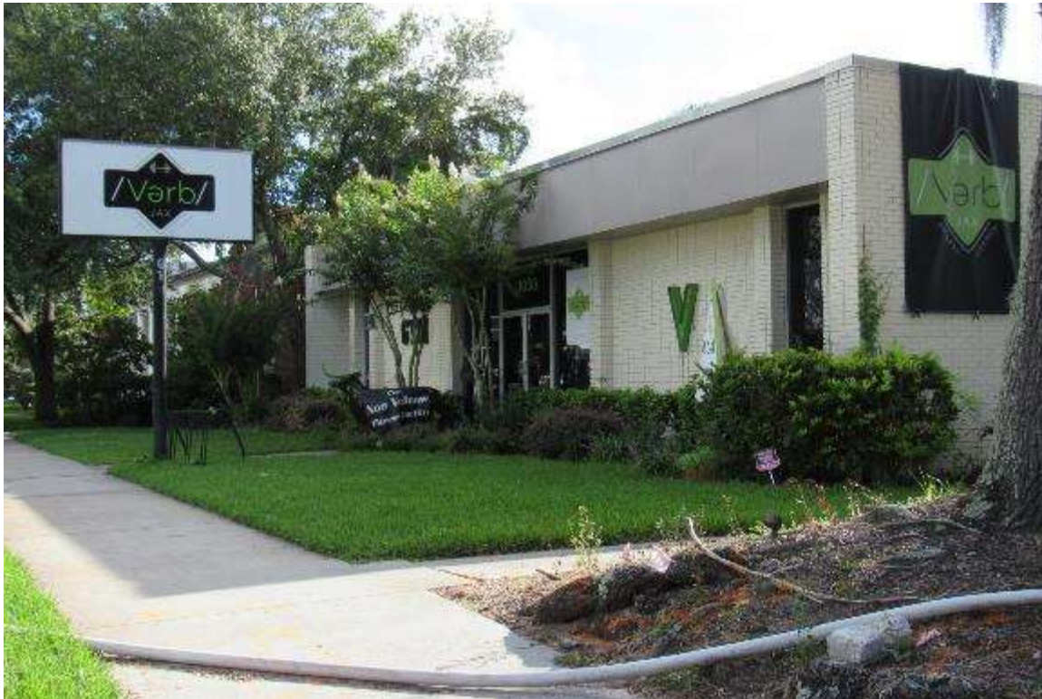
Front of existing building