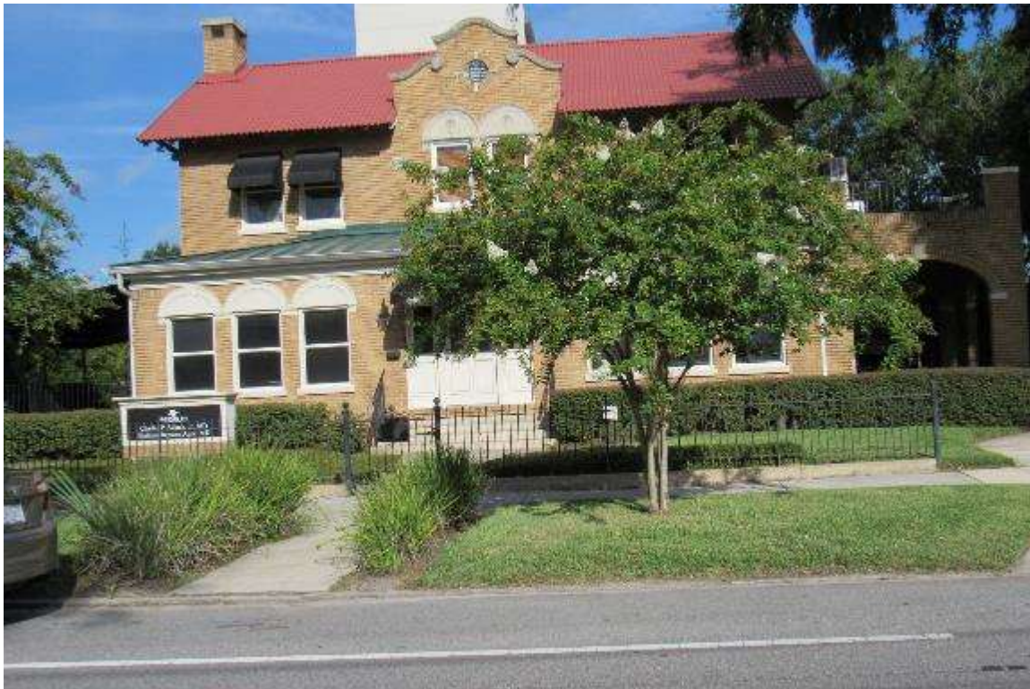
View of building across street from subject property