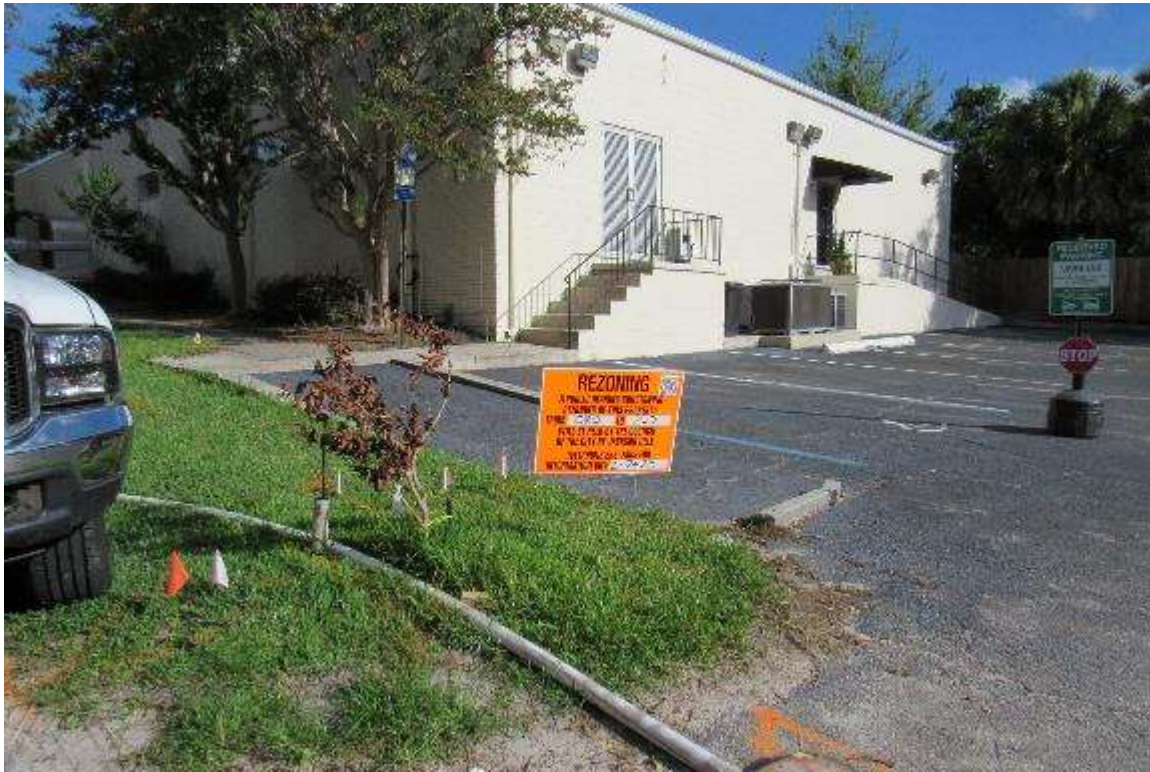
View of rear of building