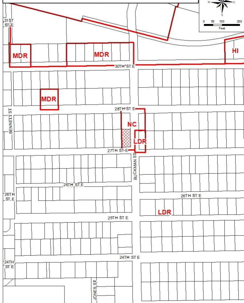
Pre-Adoption of L-6007-24C Land Use Map