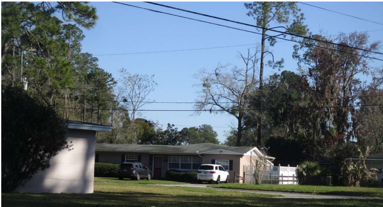
View of the subject property from Dean Road.