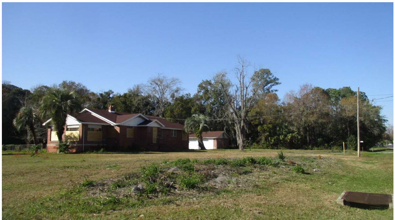
Source: Planning & Development Department, 2/27/2024 View of the subject property from Dean Road.