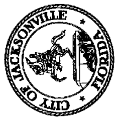
Exhibit 2 (Page 1 of 1)