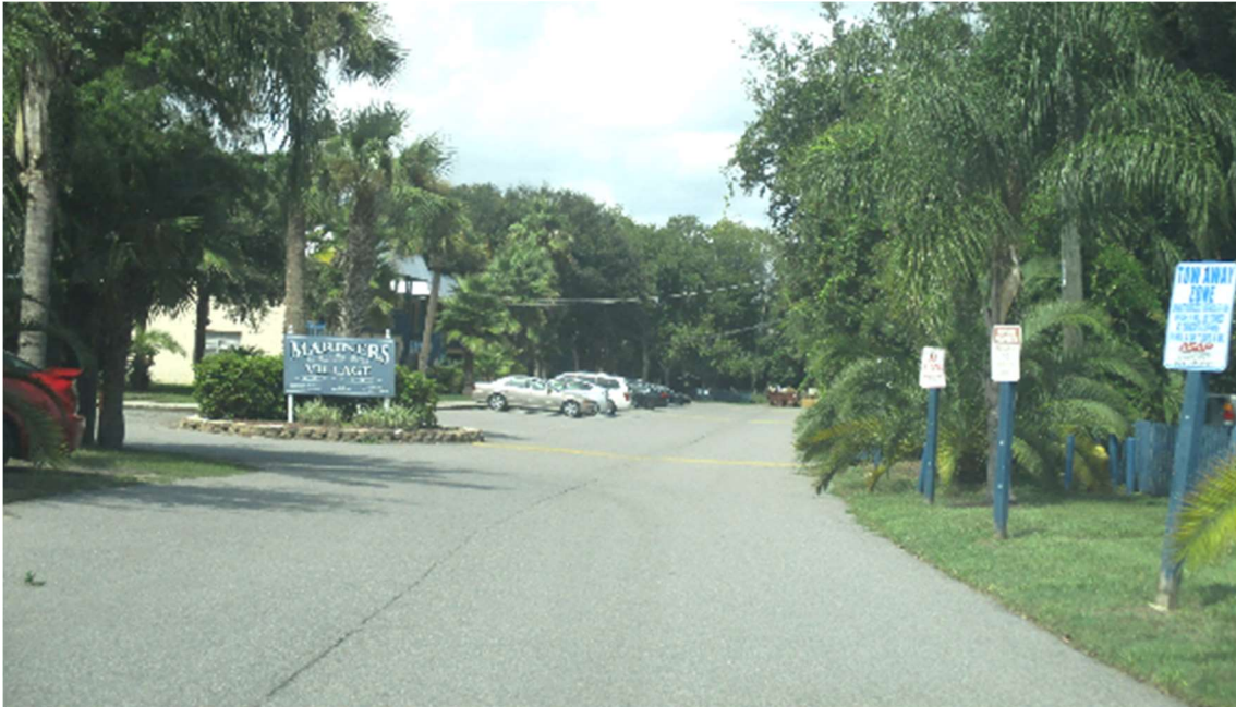
Entrance to Subject Property from Mayport Road