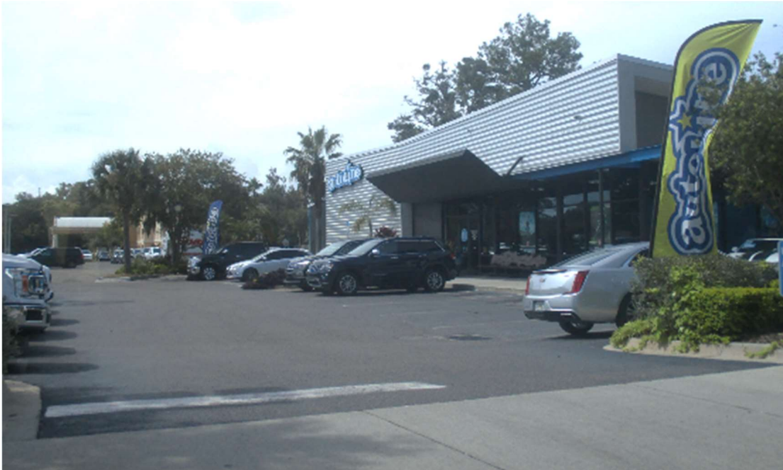
View of Property to the East