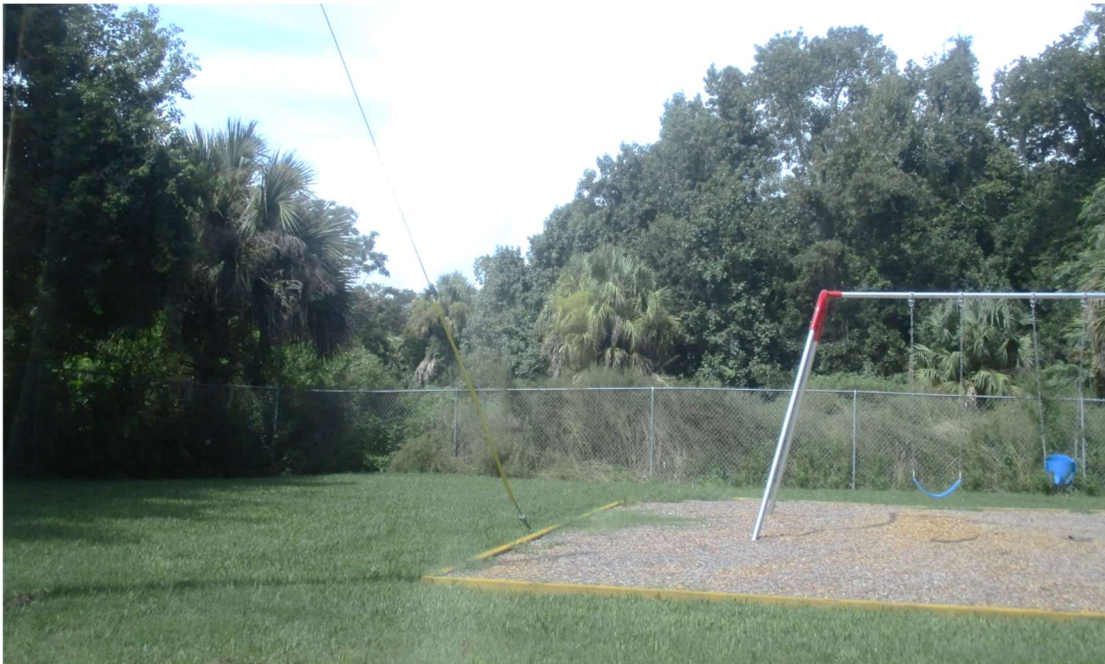
View of Future Expansion